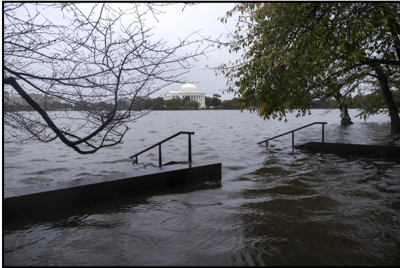
DC Tidal Basin near Jefferson Memorial

Below are some images of the resulting impacts across our region from this event.