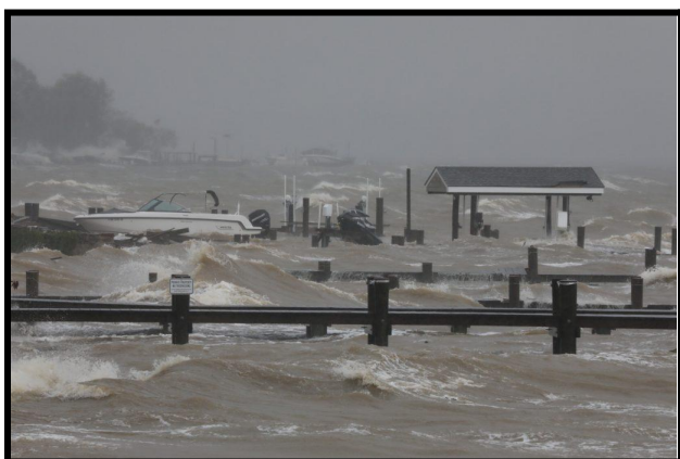
Images from downtown Annapolis via Washington Post (Left) and MD Dept. of Natural Resources (Right)