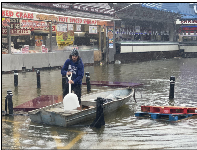
Images from the Wharf along the DC Waterfront