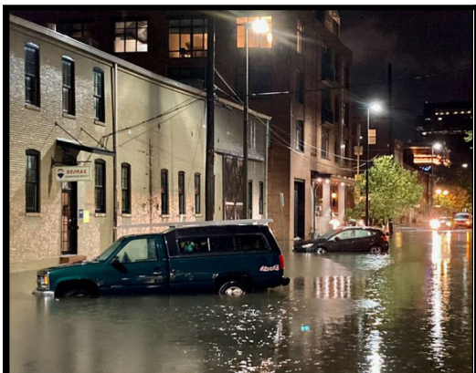
Images from Bowleys Quarters (Left) and Thomas St. in Baltimore, MD (Right)