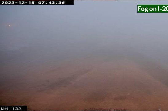
Fog on I-20 near Odessa