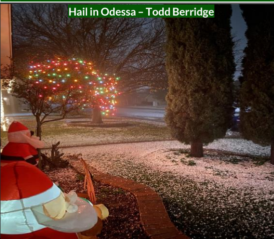
Hail in Odessa - Todd Berridge