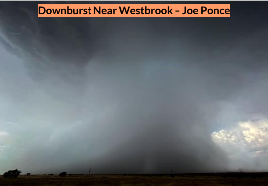
Downburst Near Westbrook - Joe Ponce