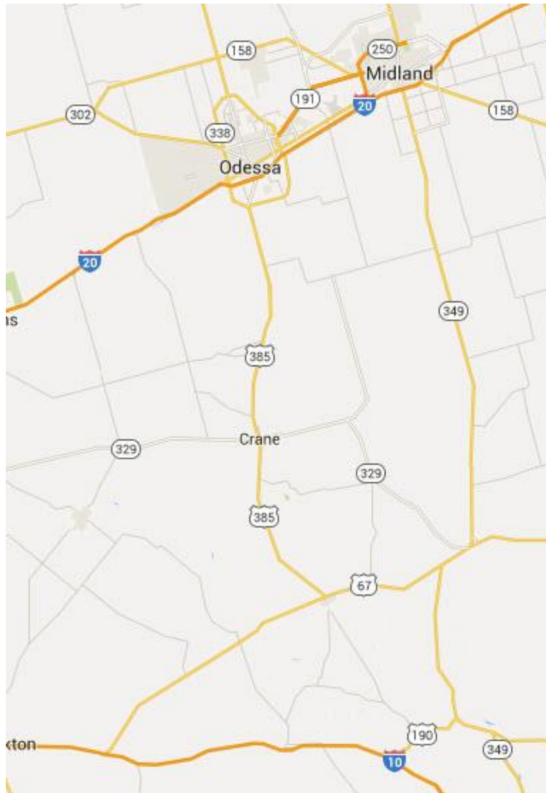
Figure 2: Location of Crane, Texas.