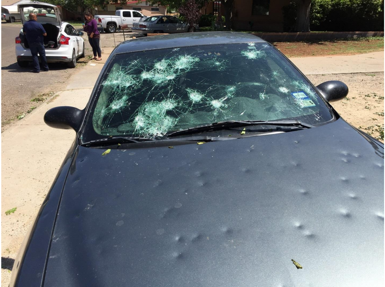
Figure 4: Hail damage to vehicle.