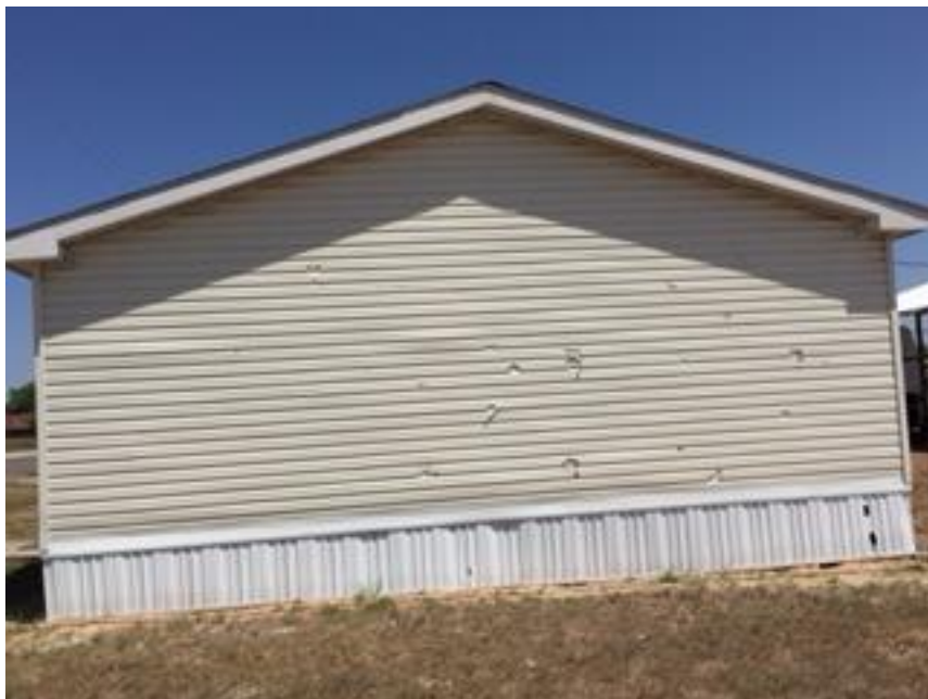
Figure 7: Hail damage to home.