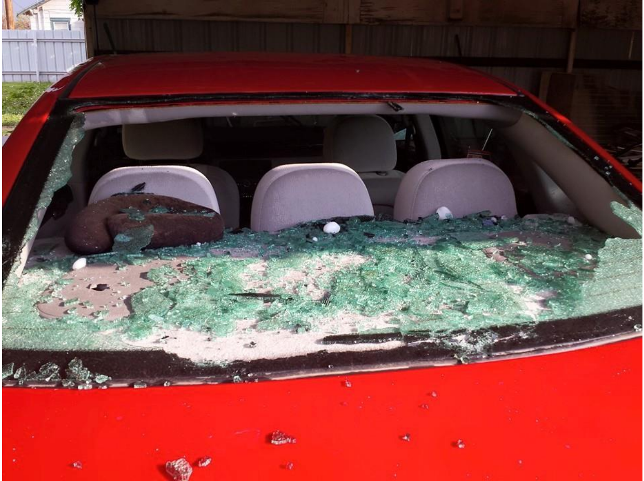
Figure 5: Hail damage to vehicle.