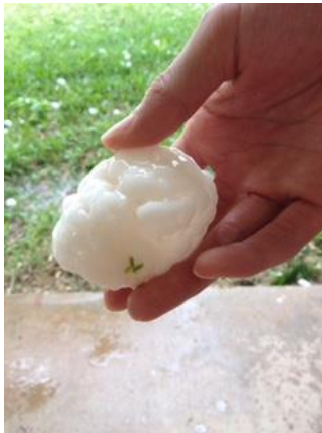
Figure 1: Golf ball to baseball size hail.

The damage seen in the town of Crane, Texas, was mainly south of North County Road (Figure 3). Many vehicles had hail damage ranging from broken windshields to numerous dents (Figures 4 and 5). The majority of the damage was to vehicles, however there was damage noted at several homes (Figures 6 and 7).