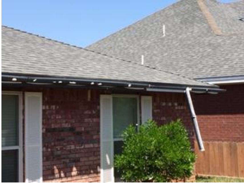
Figure 6: Hail damage to home.