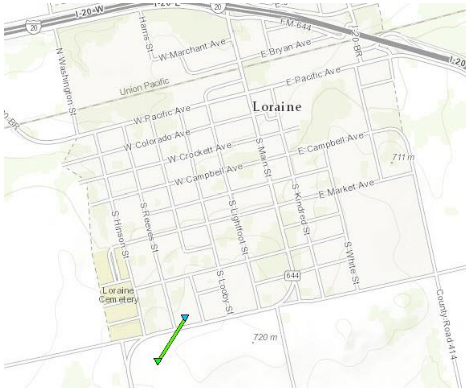
Figure 2: Path of the tornado – southwest to northeast.