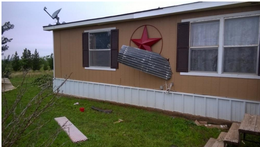
Figure 6: Debris from barn embedded in the side of the house.