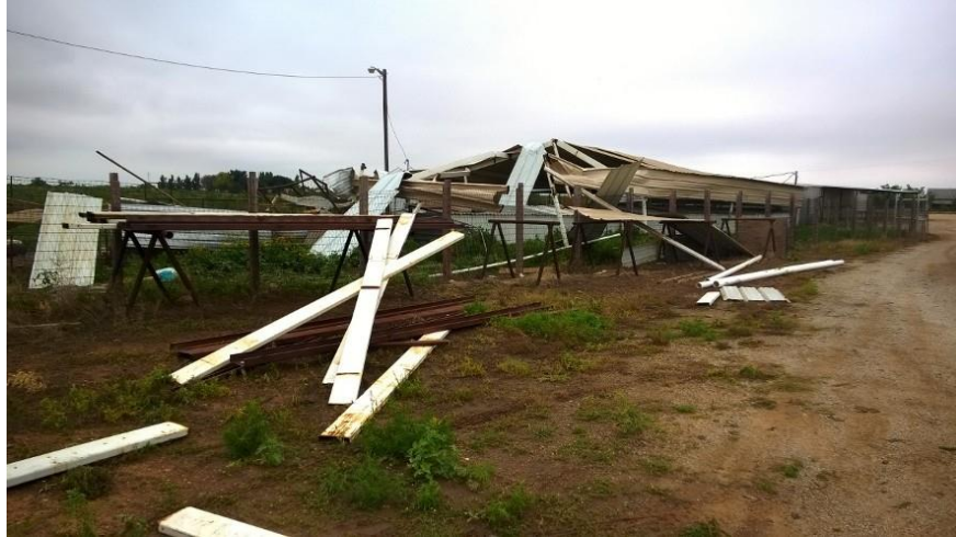
Figure 4: Damage to barn.