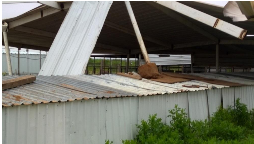
Figure 5: Pole with cement base pulled out of the ground.