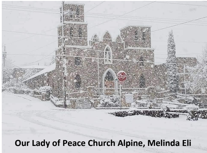
Our Lady of Peace Church Alpine

An upper-level low developed over Mexico and slowly pivoted eastward Saturday. Plenty of cold air and lift were generated by the storm system. This allowed precipitation to fall in the form of snow for areas above 3500' across the Hwy 90 corridor between Valentine and just west of Marathon in Texas.