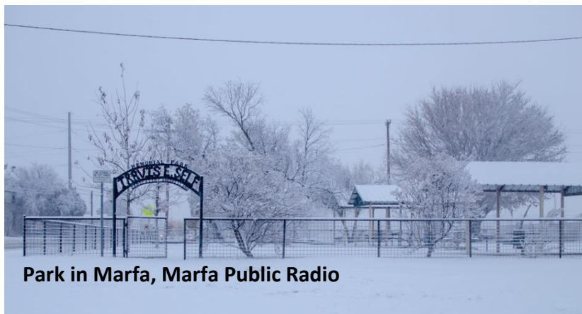
Park in Marfa

By 3AM CST, light precipitation began to develop over the Presidio valley, moving eastward through the early morning hours, and becoming broader in coverage. Marfa and Alpine began seeing snowfall prior to sunrise with the heaviest snowfall still to come through the morning hours. Totals by 9AM CST Saturday were approaching 0.5" to as much as 3" along the stretch from Valentine to Alpine with heavy snow settled