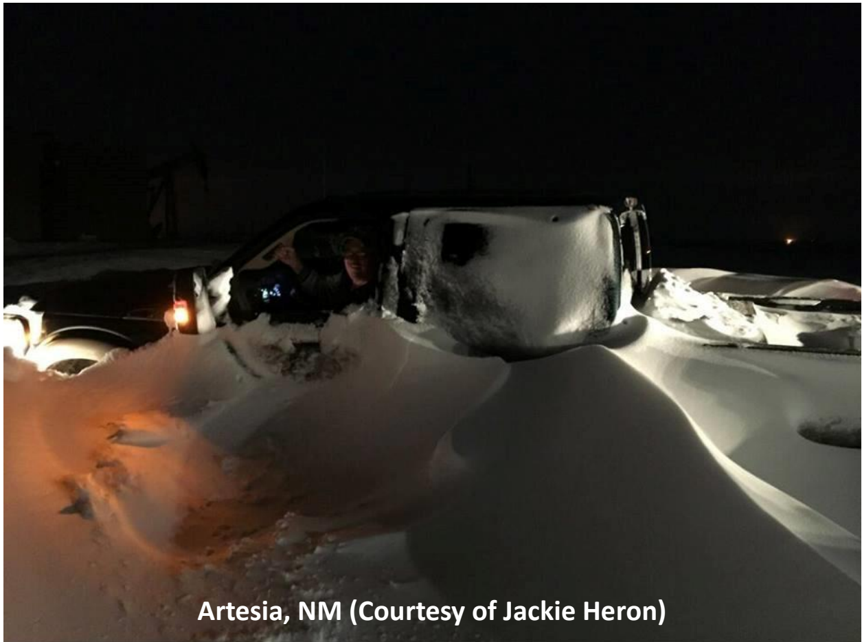
Artesia, NM

4 E EUNICE 15.0 IN 1030 PM 12/27 3 S CARLSBAD 15.0 IN 0757 PM 12/27 HOBBS 14.0 IN 0435 PM 12/27 2 NW CARLSBAD 13.2 IN 0633 PM 12/27 GREENWOOD 12.0 IN 0659 AM 12/28 MIDLAND INTERNATIONAL 7.6 IN 1200 AM 12/28 GREENWOOD 7.5 IN 0744 PM 12/27 PECOS 6.0 IN 0713 PM 12/27 MIDLAND 6.0 IN 0640 PM 12/27 MONAHANS 6.0 IN 1227 PM 12/27 ALPINE 5.0 IN 0514 PM 12/27 7 WNW ALPINE 5.0 IN 0514 PM 12/27 SNYDER 4.0 IN 0634 PM 12/27 BIG LAKE 2.0 IN 0529 PM 12/27