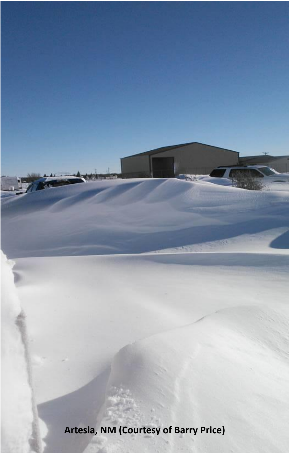
Artesia, NM