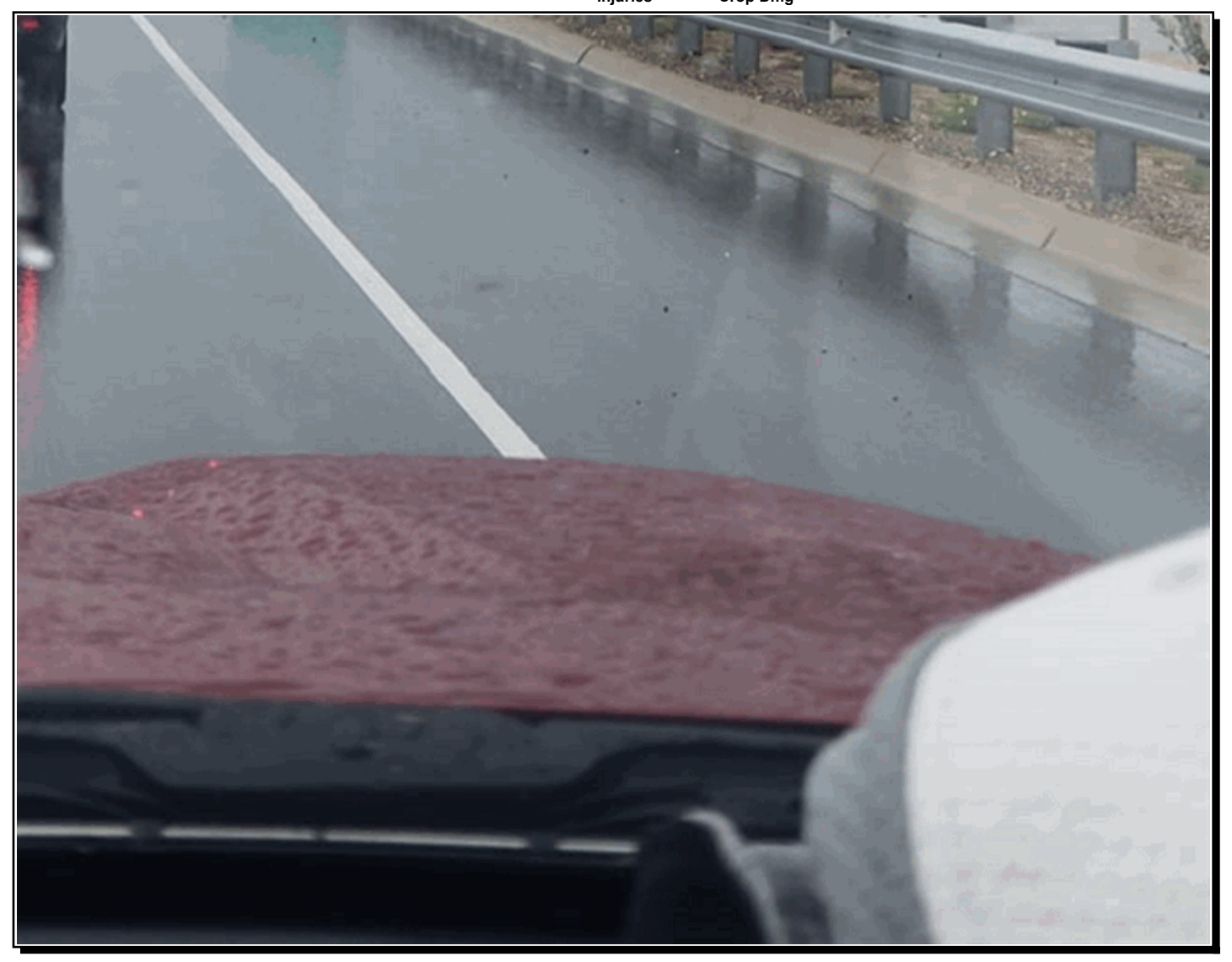
Heavy rain fell across the City of Midland and produced flash flooding.

Location Date/Time Deaths & Property & Event Type and Details Injuries Crop Dmg