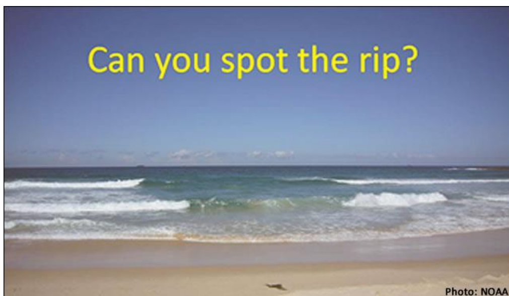
Figure 1: Rip current visible between the whites of the breaking waves