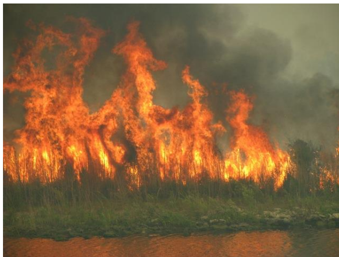
Wildfire on a dry grass bend in Lake Okeechobee