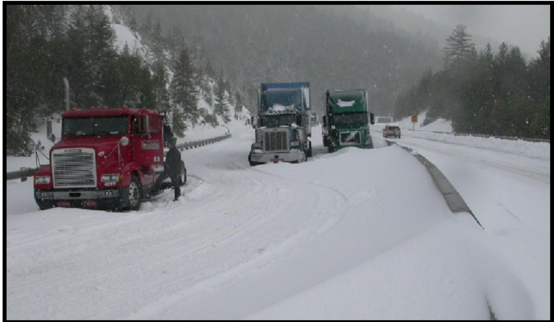
Snow drifts blew over the Jersey barriers on I-5 near Siskiyou Summit.

Twenty years later, the combination of greatly improved forecasting, communications, and road maintenance make this 2003 disaster less likely to happen but still possible if a big storm strikes on a busy travel day. The best thing you can do to prepare is check the forecast before you leave and stay off the roads during a winter storm.