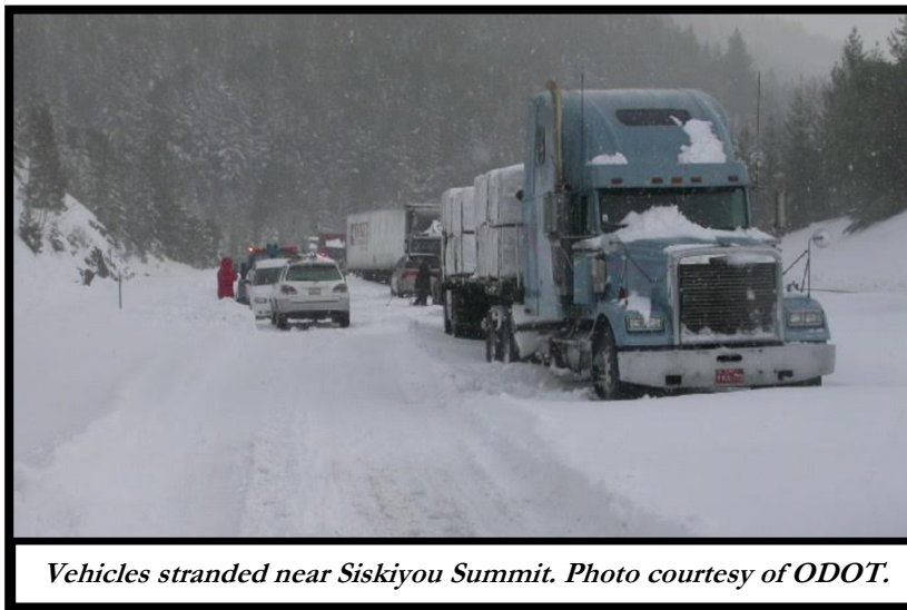
Vehicles stranded near Siskiyou Summit.

On early Saturday morning, December 27th, 2003, our office issued a winter storm watch for most of Siskiyou County above 2500 feet. Snow was expected to begin Sunday afternoon and increase in intensity Sunday night before tapering off to snow showers Monday morning with a total of 6 to 12 inches. The NWS forecast was updated late Saturday evening to include a winter storm watch Sunday night and Monday for the Cascades and Siskiyou with the potential for 1 to 1 1/2 feet of snow and windy conditions. This area included Siskiyou Summit on I-5. These watches were then upgraded to winter storm warnings early Sunday morning, the day of the storm.