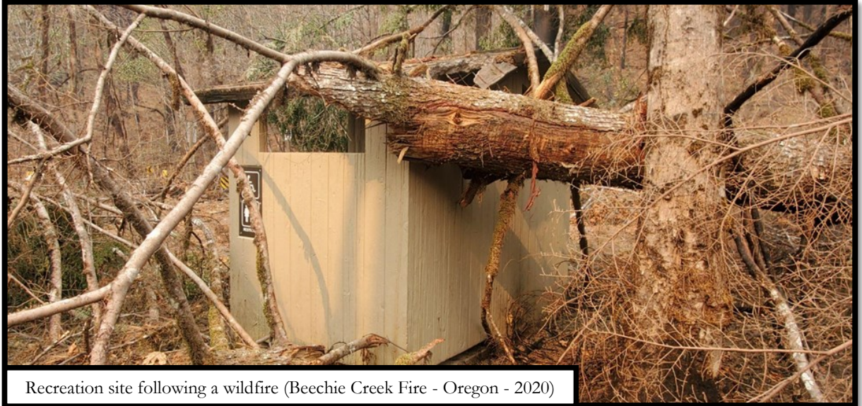
Recreation site following a wildfire (Beechie Creek Fire - Oregon - 2020)

Recreation - Wildfires typically burn through forests. In these forests, you'll often find recreation infrastructure such as campgrounds, boat launches, interpretive signs, trails and trail heads, wildlife viewing areas, etc. These areas must be handled carefully