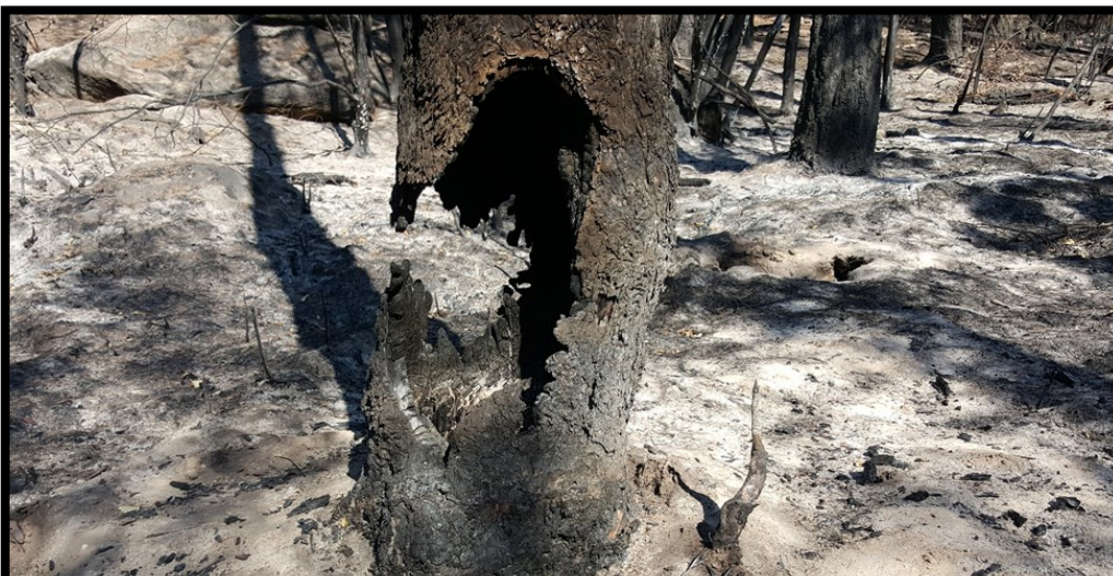
Hazard Trees can remain a danger in a burn area for years to come. (High Cascades Fire - Crater Lake National Park - 2017)

Forestry - Trees are one of the main fuel sources for wildfires and one of the greatest hazards that remain after a wildfire. Hazard trees are trees that have been damaged by wildfire and are likely to fall on a nearby target. A target is anything of value that