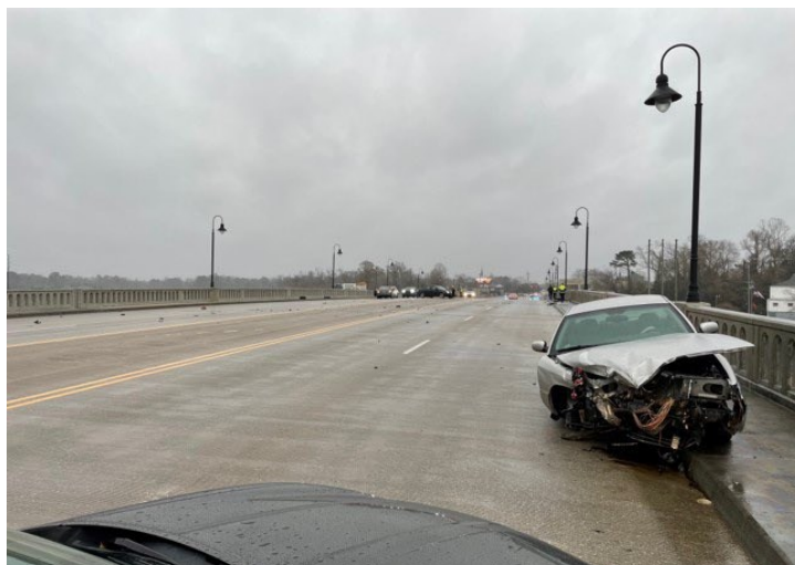
Icy bridge in Jacksonville, NC

For a full summary of this historic ice/winter storm, visit our significant event review page at weather.gov/mhx/pastWinterStormJanuary212022 .