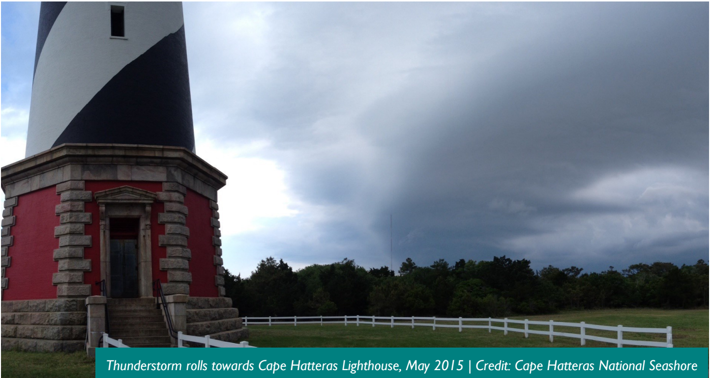
Thunderstorm rolls towards Cape Hatteras Lighthouse, May 2015