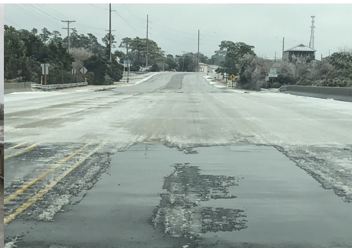
Broad Creek Bridge on Hwy 24 Iced Over