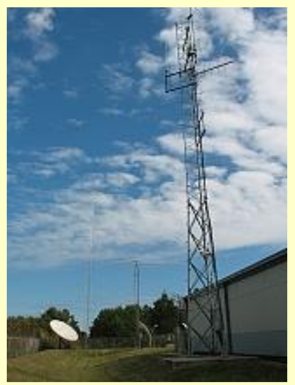
GAP Voyager, CL33 rotatable beam & VHF tower