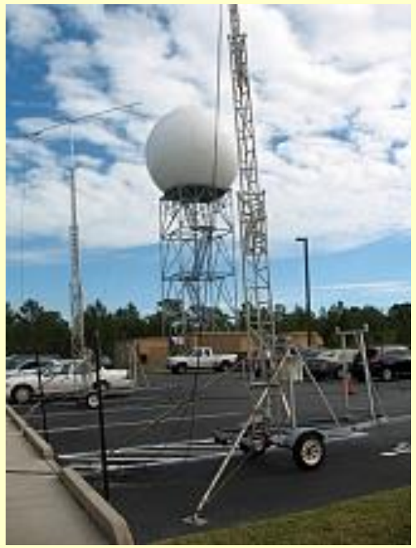
Portable VHF towers with 2m & 6m VHF beams

During the first weekend of December, the National Weather Service Office in Melbourne, Florida supported SKYWARN<sup>™</sup> Recognition Day for the 10th consecutive year. The event for Amateur Radio (ham) operators was held from 7 pm Friday December 5 until 7 pm Saturday December 6 and was co-sponsored by the National Weather Service and the American Radio Relay League . The event is held each year to celebrate the contributions that ham radio operators make to the National Weather Service during times of critical weather. During the event, hams across the country contact as many other NWS offices as possible using their radio equipment. The contacts are received and logged at the individual NWS offices by volunteer amateur radio operators and licensed NWS staff.