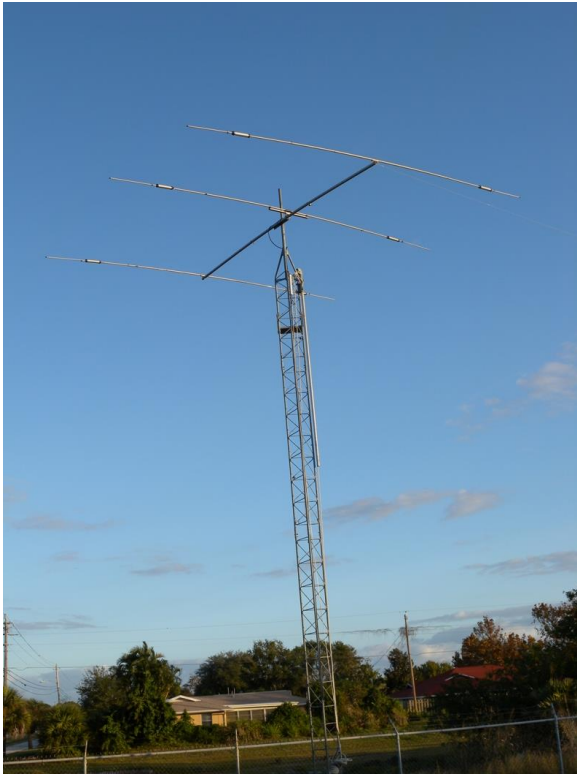
CL-33 rotatable beam