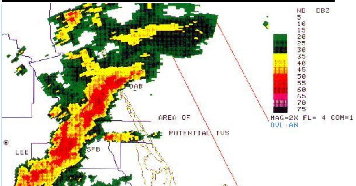
Reflectivity display of associated severe thunderstorm. Note the "inflow notch". (b-ref/.5 deg/2132z)