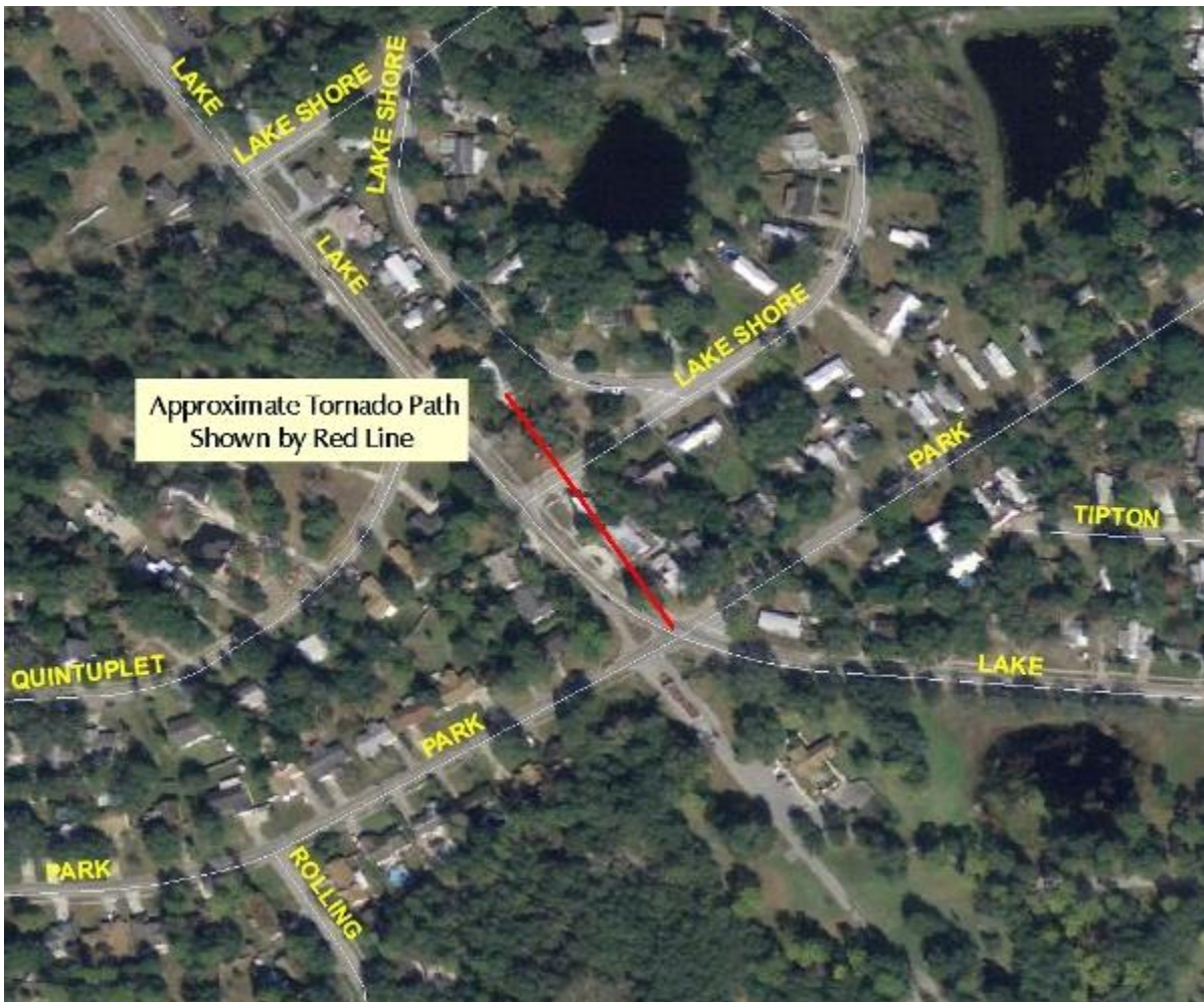
A sampling of damage caused by the tornado