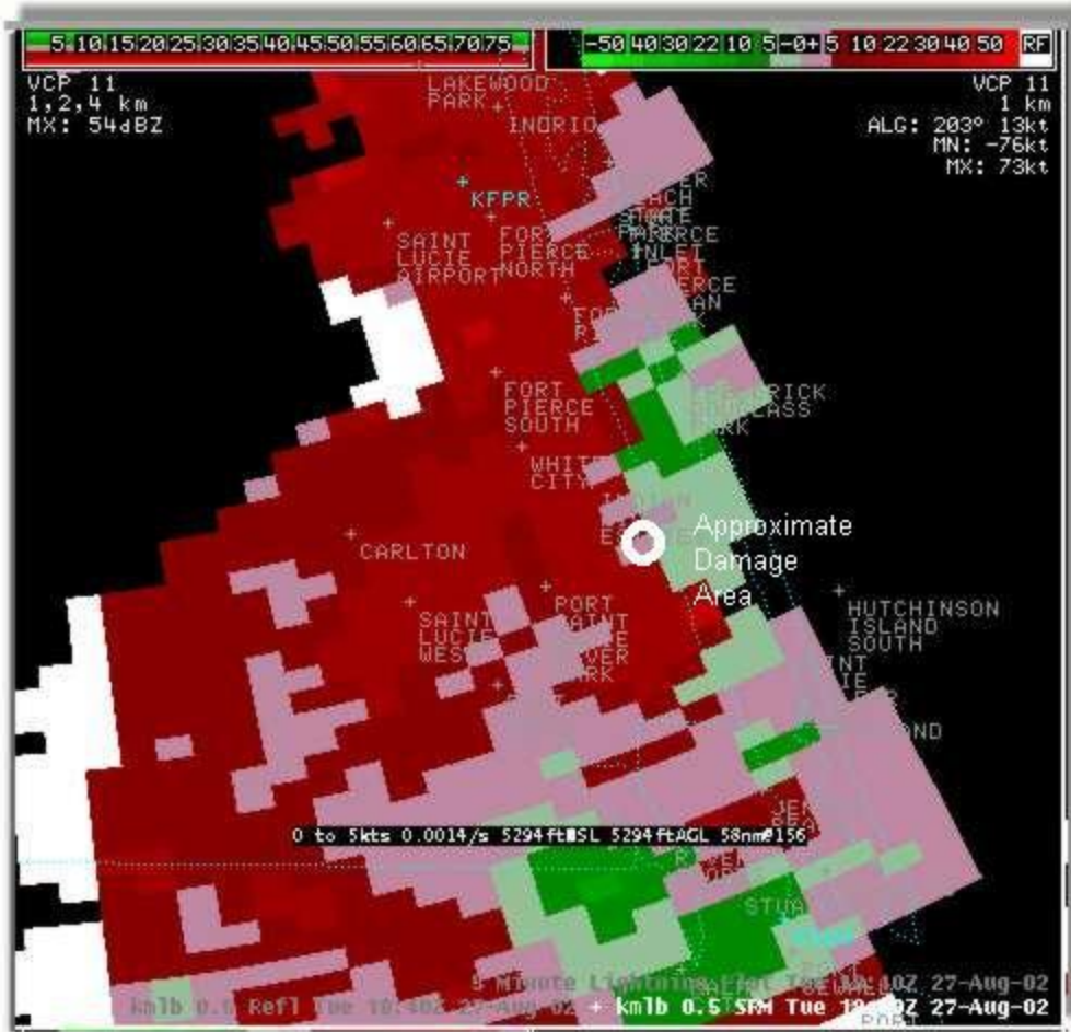
Storm Relative Motion at 1940z (2:40 PM)