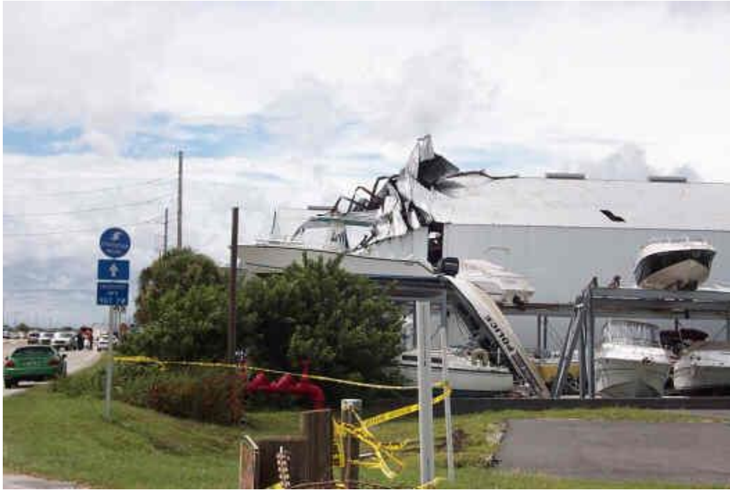
Damage at Anchorage Yacht Basin

National Hurricane Center Summary of Gabrielle