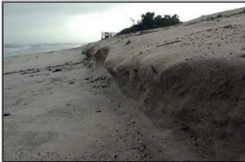
Ophelia's primary impact was beach erosion

National Hurricane Center Summary of Ophelia (pdf)