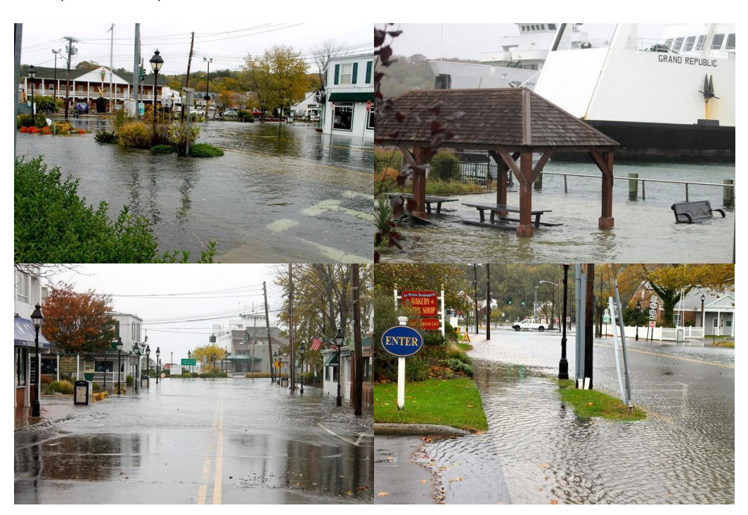
Sound Beach -

<u>Pt Jefferson</u> – 1 to 2 ft of inundation at the ferry terminal and adjacent areas of main street and 25A. (10/29/2012)