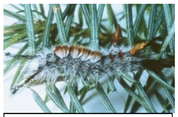
Douglas Fir Tussock Moth in caterpillar stage