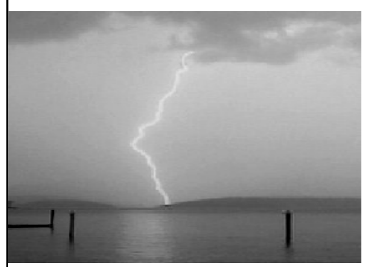
A lightning strike captured over Lake Coeur d'Alene on May 19th by Kootenai County spotter #62