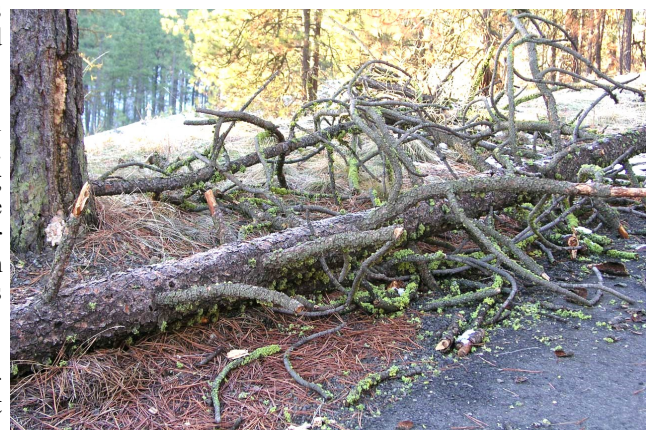
Tree damage seen around south Spokane from Nov. 19th

By 9 am, the main event was tapering off as a strong cold front swept through the region. This front represented a sharp air mass boundary that dropped the temperature 15 de-