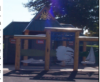
The facility at the 3rd Street boat launch

The collaborating efforts from all three of these organizations resulted in the installation of a weather radio receiver at the facility, that can be activated by boaters to get current weather information before they depart onto the lake. Over 8000 boaters use this boat launch each year. It is anticipated that the new radio and the information it provides will greatly enhance boater safety in the years to come. \ncong Ken Holmes.