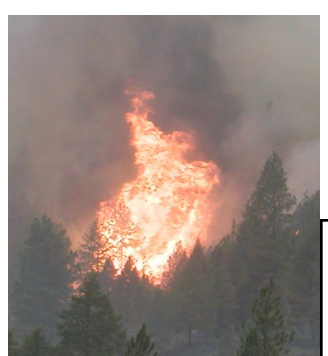
Mill Canyon fire near Coulee Dam on Aug 3

While the focus for wildfires in the U.S. was along the east slopes of the Washington Cascades late in the summer, it could have been much worse. Overall there were 1432 fires reported in the state of Washington in 2004 that burned 92,021 acres. By comparison the 10 year average is 1371 fires for 130,943 acres. In addi-