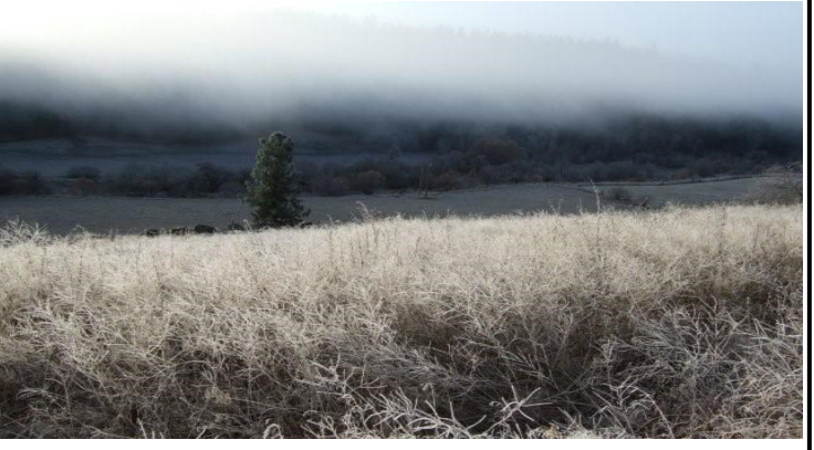
November Frost and Fog in Deep Creek Canyon - Spokane #184

Lewiston picked up 0.67" of rain while Kellogg received in October or November, which has happened only twice in