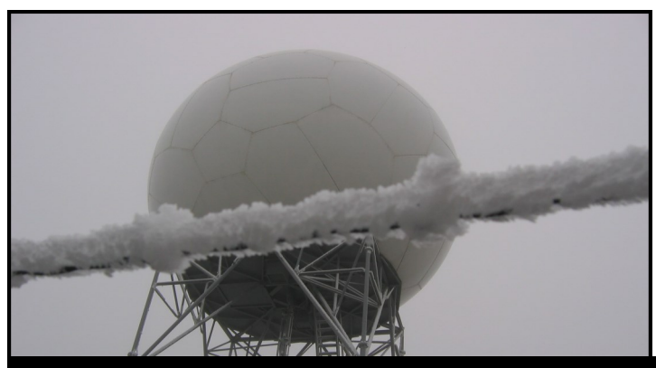
Riming on the fence near the NWS Spokane radar on 1/23/14

Training for this program is easy. There are many terrific YouTube videos, slideshows and presentations online that can help you step by step with all your needs. To learn more and where to register, please visit <a href="www.cocorahs.org">www.cocorahs.org</a> \approx Robin Fox