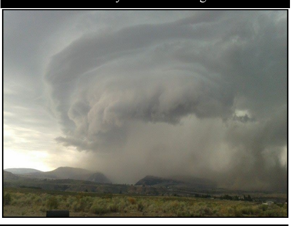
Warning: Severe or hazardous weather is likely or is occurring in the warned area. DANGER—ACT NOW!

Severe Thunderstorm in near Omak 8/29/13