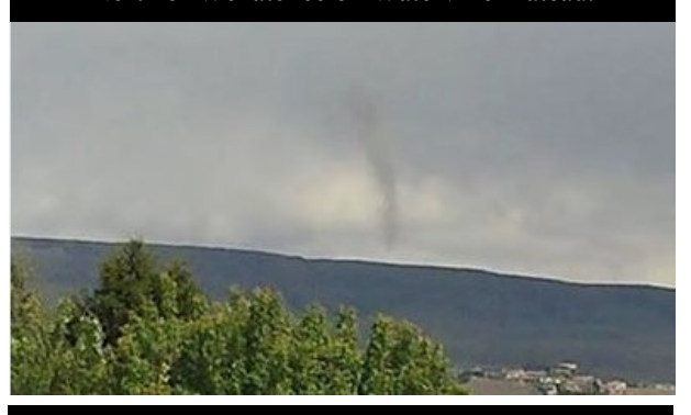
Tornado? Memorial Day @ 7:30 pm. Spotted near Wilbur.