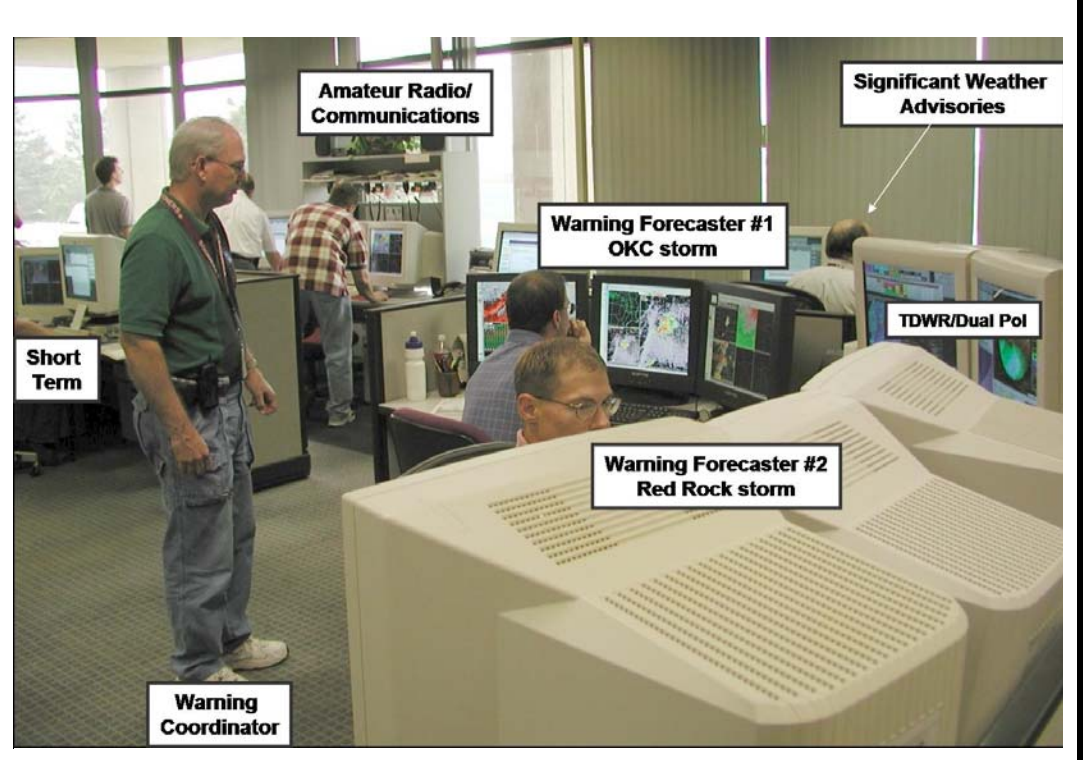
The many different roles played by staff at the Norman Forecast Office during a significant event are clearly displayed in the photo from the May 8, 2003 severe weather event.

It is not unusual for forecasters, technicians, meteorologist interns, and others to come in early and stay late, working extended hours for several days in a row to help handle significant