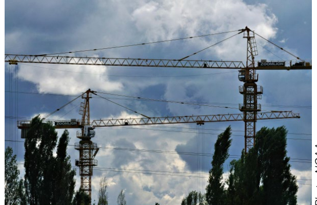
Figure 3: Cranes are especially vulnerable to lightning.

Employers should also post information about lightning safety at outdoor worksites. All employees should be trained on how to follow the EAP, including the lightning safety procedures.