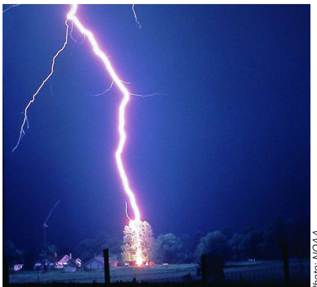
Figure 1: Lightning strikes tall tree.