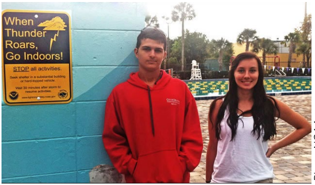
Figure 4: Preparedness reduces lightning risks.

An employer's EAP may include lightning warning or detection systems, which can provide advance warning of lightning hazards. However, no systems can detect the "first strike," detect all lightning, or predict lightning strikes. NOAA recommends that employers first rely on NOAA weather reports, including NOAA Weather Radio All Hazards: www.nws.noaa.gov/nwr.