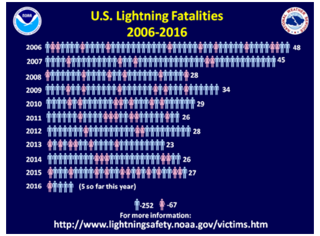
Figure 6: Annual lightning fatalities

For information on lightning safety, or to obtain data, educational and outreach materials, and posters, visit NOAA's lightning safety website: www.lightningsafety.noaa.gov or the wrn program at noaa.gov/wrn. Contact NOAA at wrn.feedback@noaa.gov. Examples of data available from NOAA are provided below.