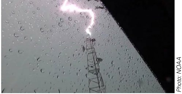
Figure 2: Lightning strikes a communications tower.

Check NOAA Weather Reports: Prior to beginning any outdoor work, employers and supervisors should check NOAA weather reports (weather.gov) and radio forecasts for all weather hazards. OSHA recommends that employers consider rescheduling jobs to avoid workers being caught outside in hazardous weather conditions. When working outdoors, supervisors and workers should continuously monitor weather conditions. Watch for darkening clouds and increasing wind speeds, which can indicate developing thunderstorms. Pay close attention to local television, radio, and Internet weather reports, forecasts, and emergency notifications regarding thunderstorm activity and severe weather.