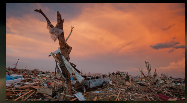
After a tornado, watch out dangerous debris such as sharp metal, glass or downed power lines.