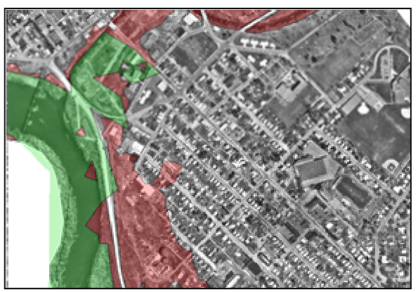
Figure 3 – Flood map comparing USGS data and AutoCAD data (1996 Flood).