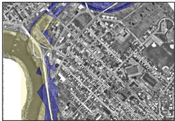
Figure 2 – Flood map comparing USGS data and AutoCAD data (1984 Flood).

shows that the flood map generated using the USGS data is significantly less accurate than the flood map generated using the AutoCAD data. It is also noted that the flood map could not adequately move up the tributary. The error is due primarily to the large contour interval ( \sim 6 m vs. \sim 0.6 m). The peak water surface profile 1996 flood event is also mapped and similar results are shown in Figure 3.