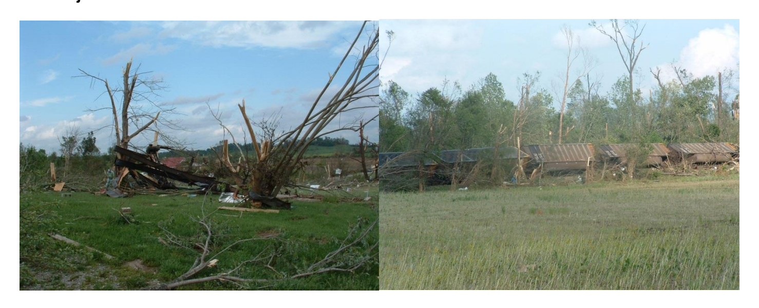
MORE DAMAGE PHOTOS of the F4 TORNADO:

The occupant of a mobile home in the same area was not as fortunate. The first photo below shows the frame of the mobile home wrapped around two trees that were stripped of all their limbs. The second photo shows part of an overturned train between Hillerman and the Mermet Lake Conservation Area, located just west of U.S. Route 45.