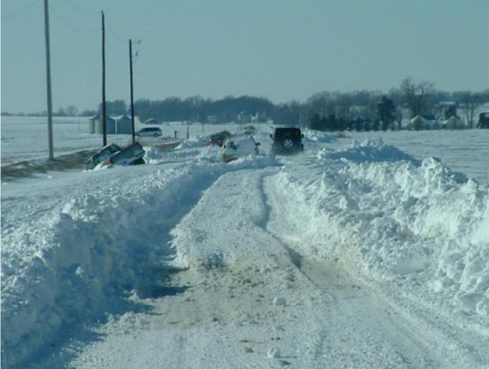
Photo of State Route 168 about two miles west of Fort Branch, IN, where 20 inches of snow fell. Drifts were up to 5 feet.