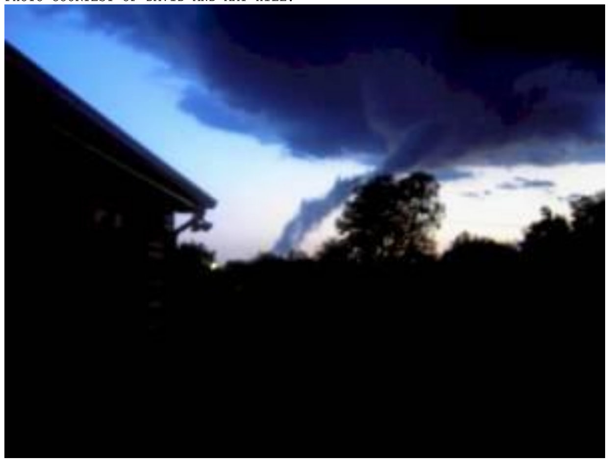
PHOTO OF TORNADO TAKEN ABOUT 4 MILES EAST OF HANSON, KY NEAR MADISONVILLE.

In addition to the tornadoes on May 30, widespread straight-line winds around 60 MPH buffeted large parts of southeast Missouri, western Kentucky, southern Illinois, and southwest Indiana. There were reports of large hail, especially across southeast Missouri. Following is a list of all the reports: