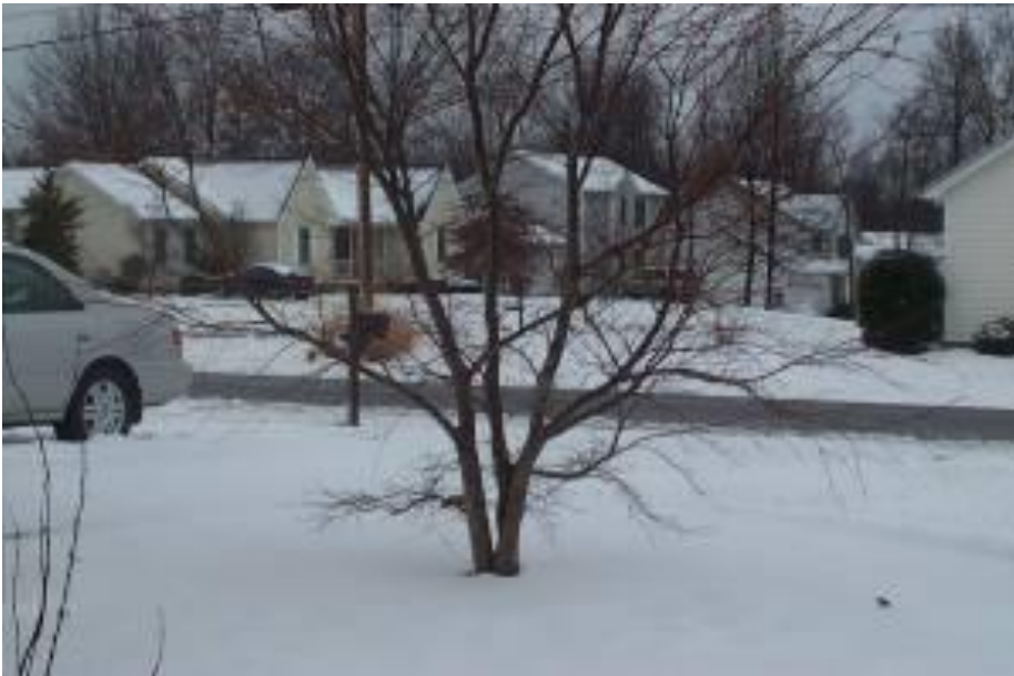
PHOTO BELOW TAKEN ON FEB. 5 IN A NEIGHBORHOOD NEAR PADUCAH KENTUCKY AFTER TEMPERATURES ROSE ABOVE FREEZING.

PUBLIC INFORMATION STATEMENT...SNOWFALL AND ICE REPORTS NATIONAL WEATHER SERVICE PADUCAH KY 930 AM CST THU FEB 5 2004