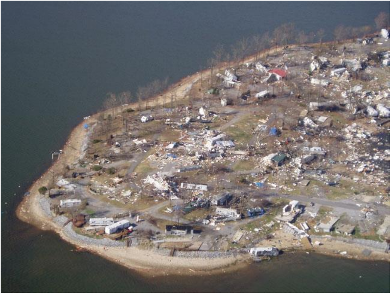
The following pictures are of the heavily damaged Moors Marina...