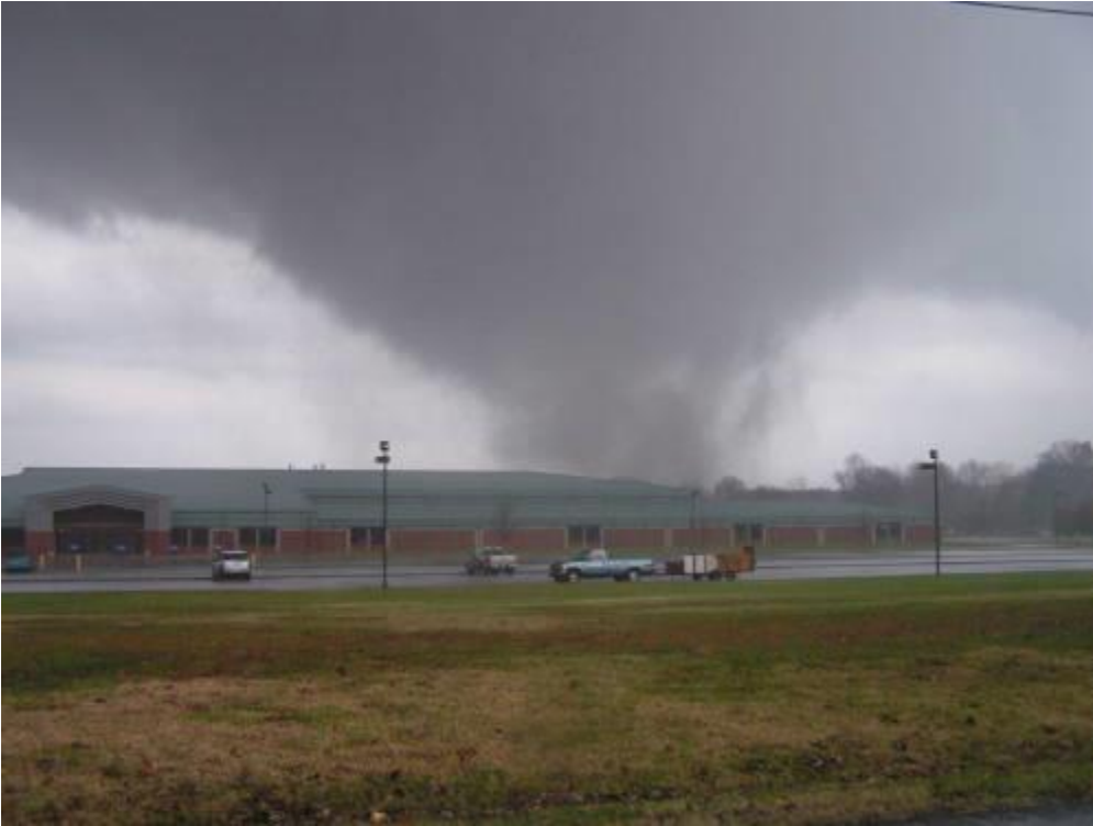
Photo of actual tornado