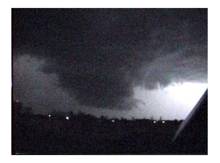
Wall cloud lit up by lightning