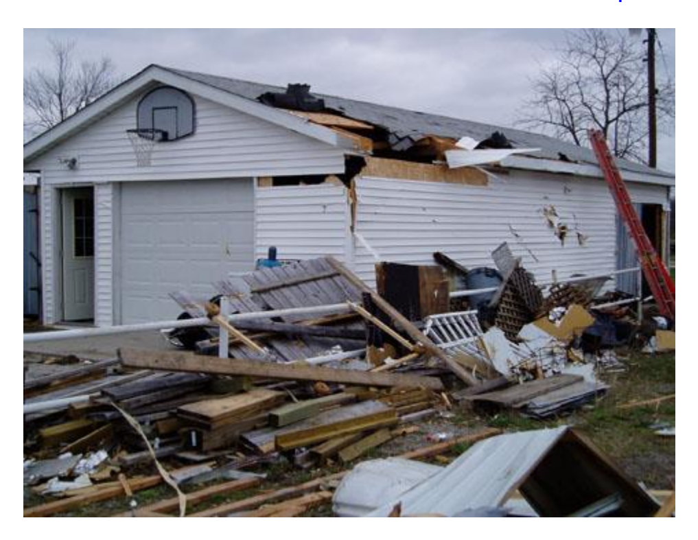
Damage to a house near the Fairfield Airport