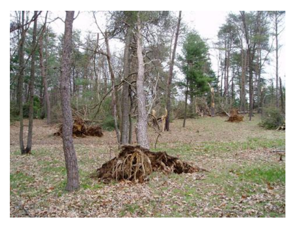
Uprooted and snapped trees in Fairfield, IL