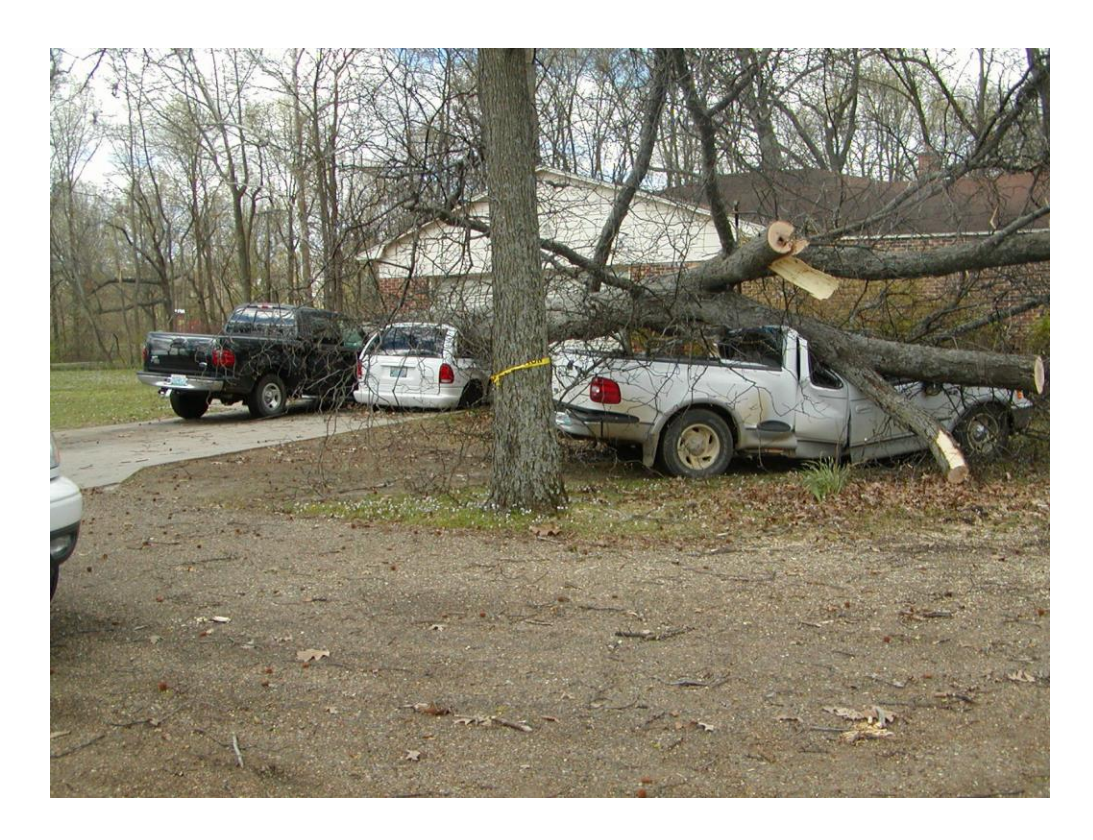
Tree on three vehicles in Dexter, MO