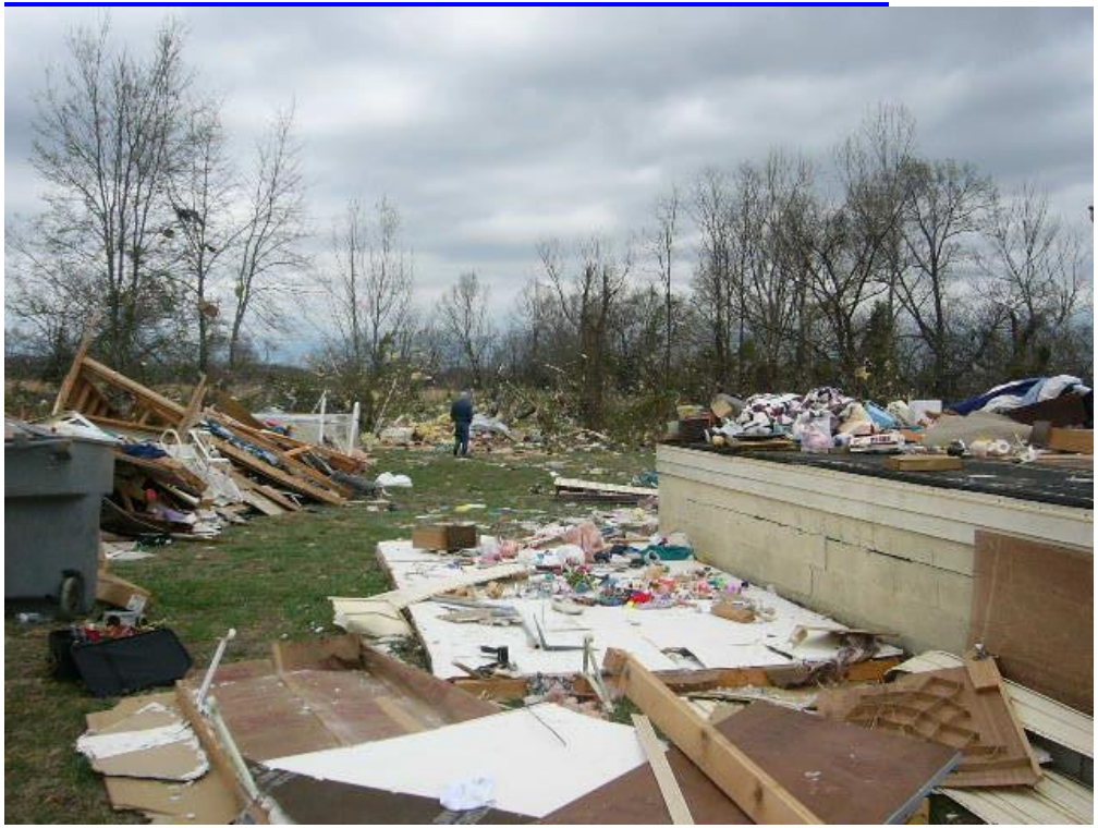
House destroyed on Billy Goat Road