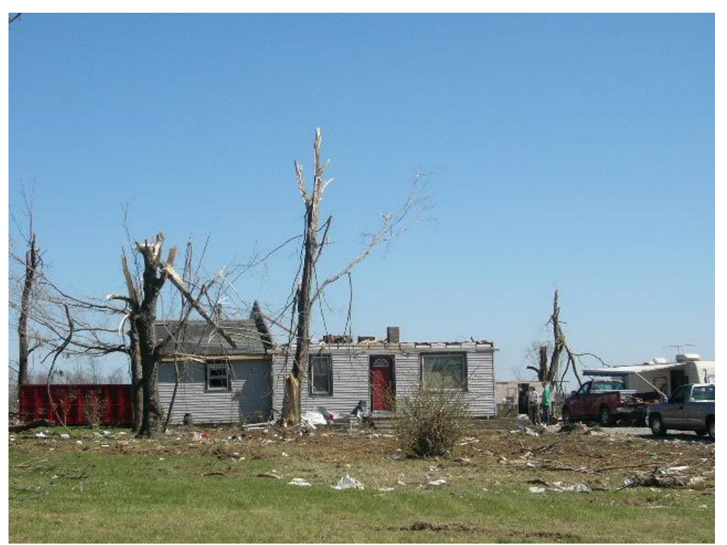
Damaged house on Greenville Road