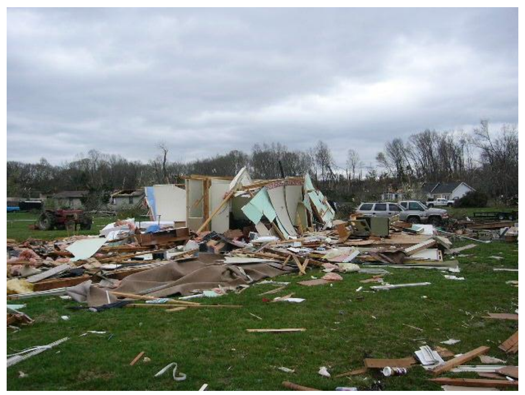
Destroyed home on Princeton Road