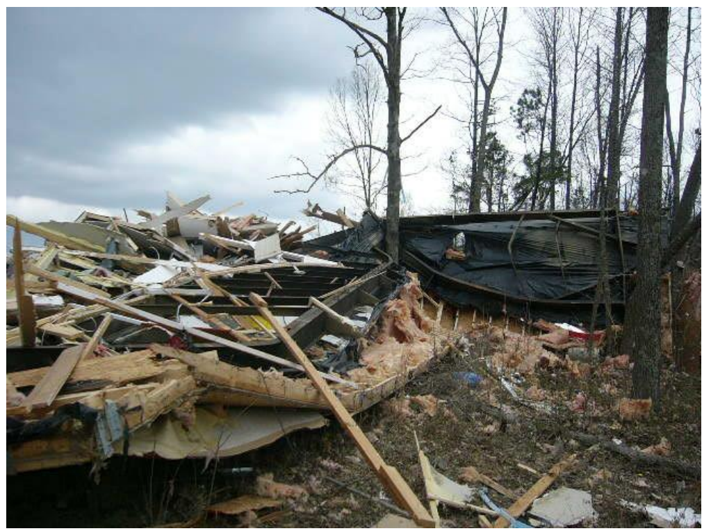
Mobile home wrapped around a tree near Dawson Springs Road.