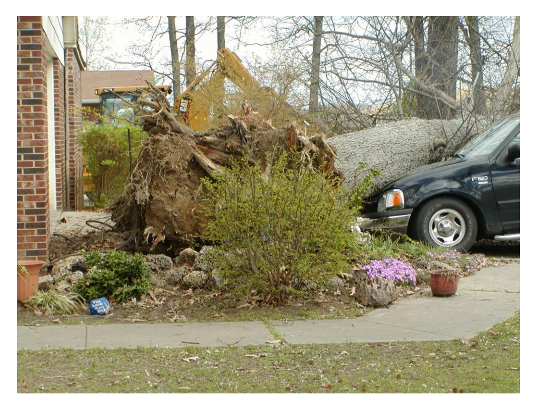
Alternate view of tree on three vehicles in Dexter, MO