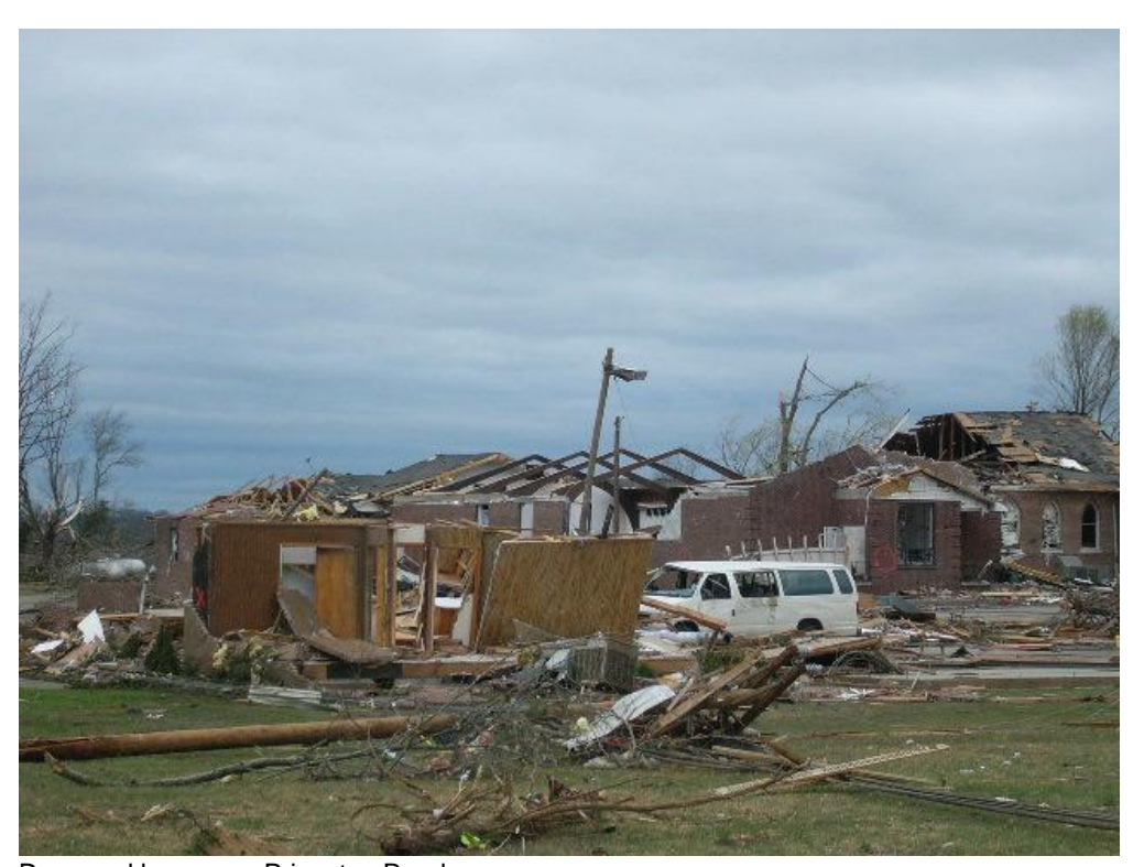
Damaged homes on Princeton Road