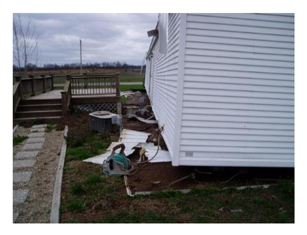
Mobile home moved off its foundation one half mile north of the Fairfield Airport