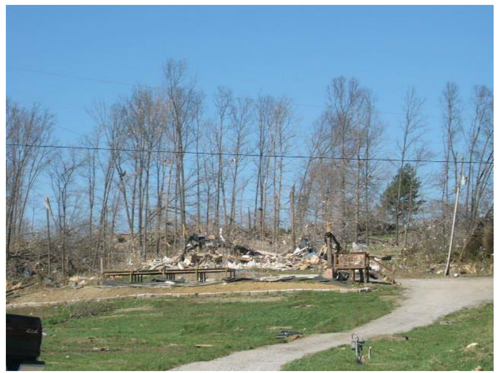
Mobile home destroyed near Greenville Rd/Gleason Lane