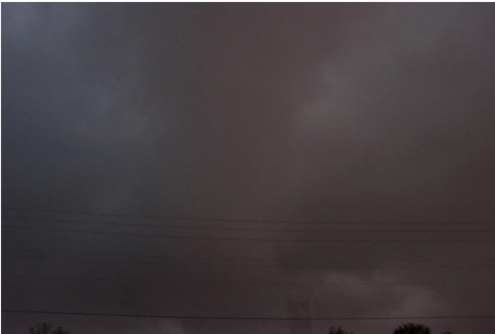
Photo of large hail in Jackson, MO

Picture of a possible funnel cloud or tornado on the west city limits of Lilbourn, MO on State Route D