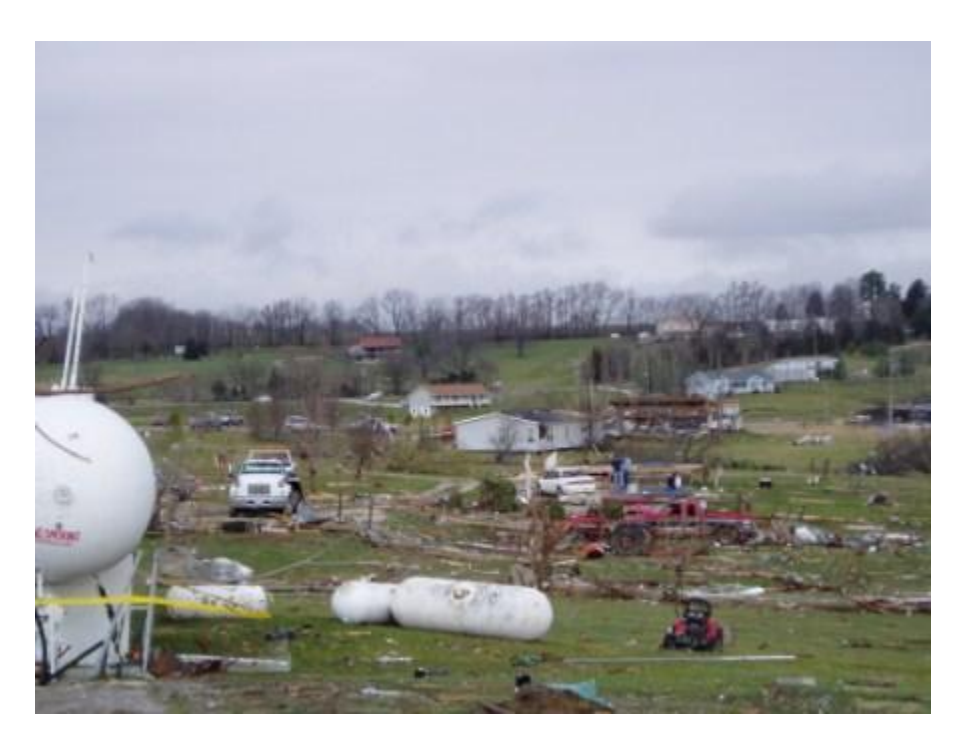
Photo of site of two fatalities in Perry County, MO tornado. This site along U.S. Highway 61 is where a vehicle was thrown into the propane tank, killing the occupants. They had just left their mobile home for safer shelter.