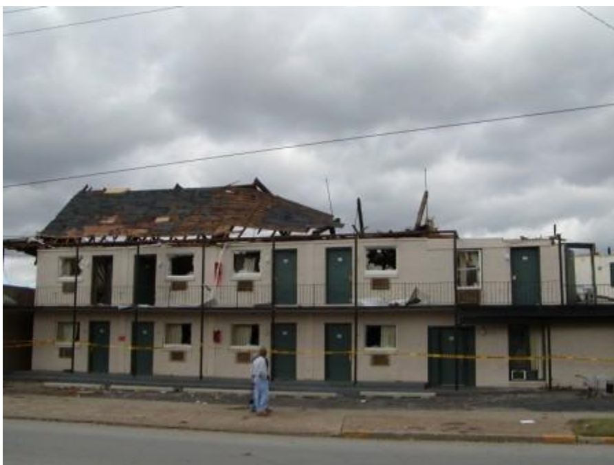
Photo of damage to an Owensboro motel...