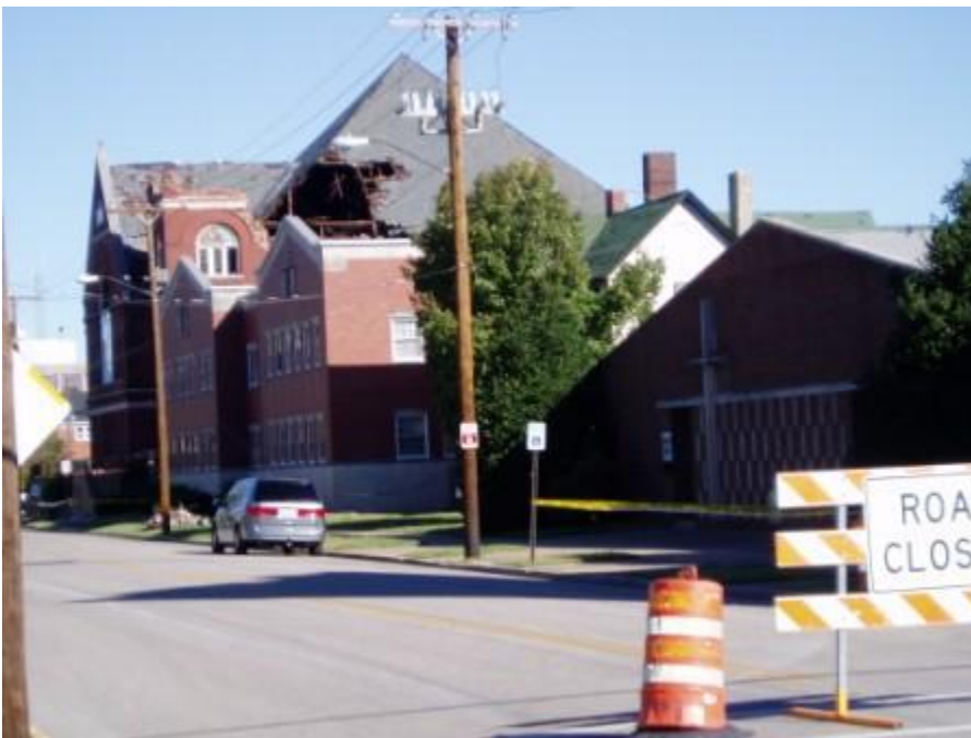
Major damage inside the church...