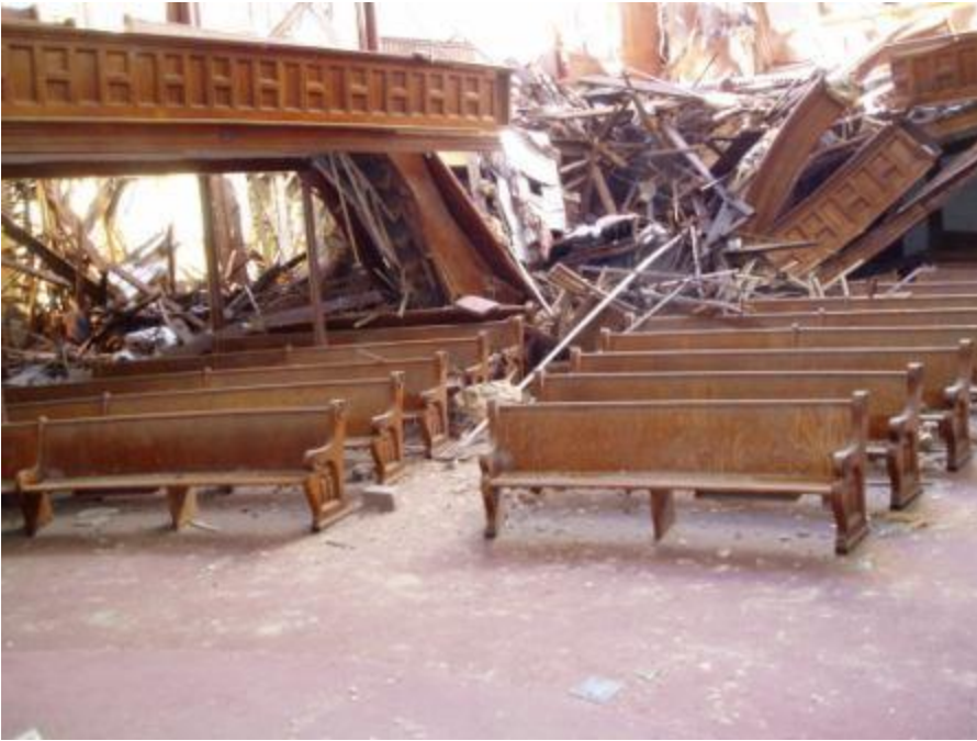
A slate shingle was embedded into the side of a church...