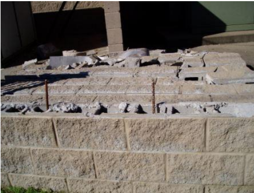
An older building with a garage wall that was blown out...