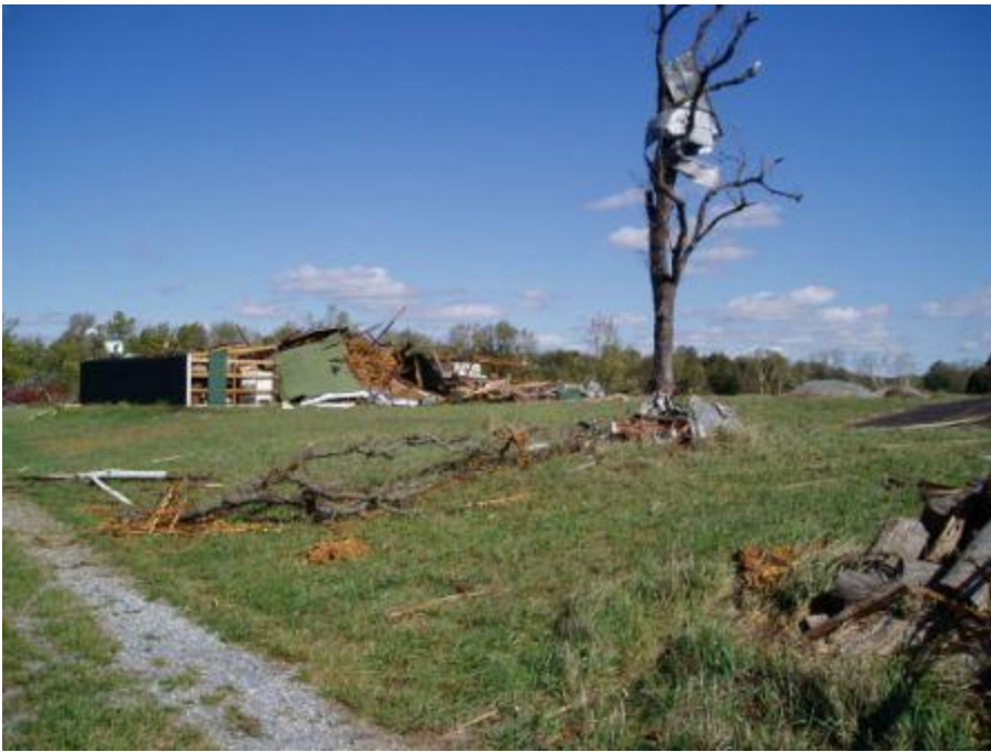
Garage and tobacco barns were destroyed...