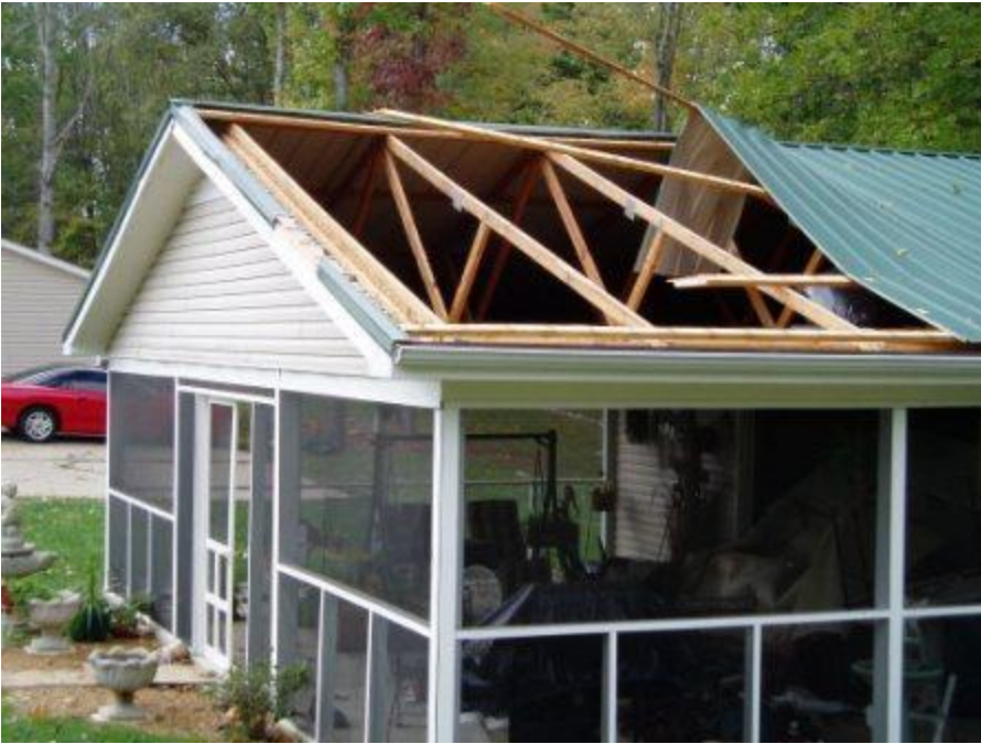
Damage to house roof and siding in Blue Springs...