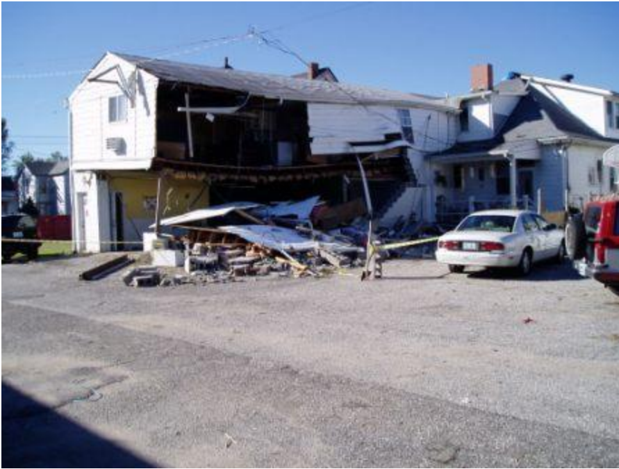
Significant damage to a Baptist church...