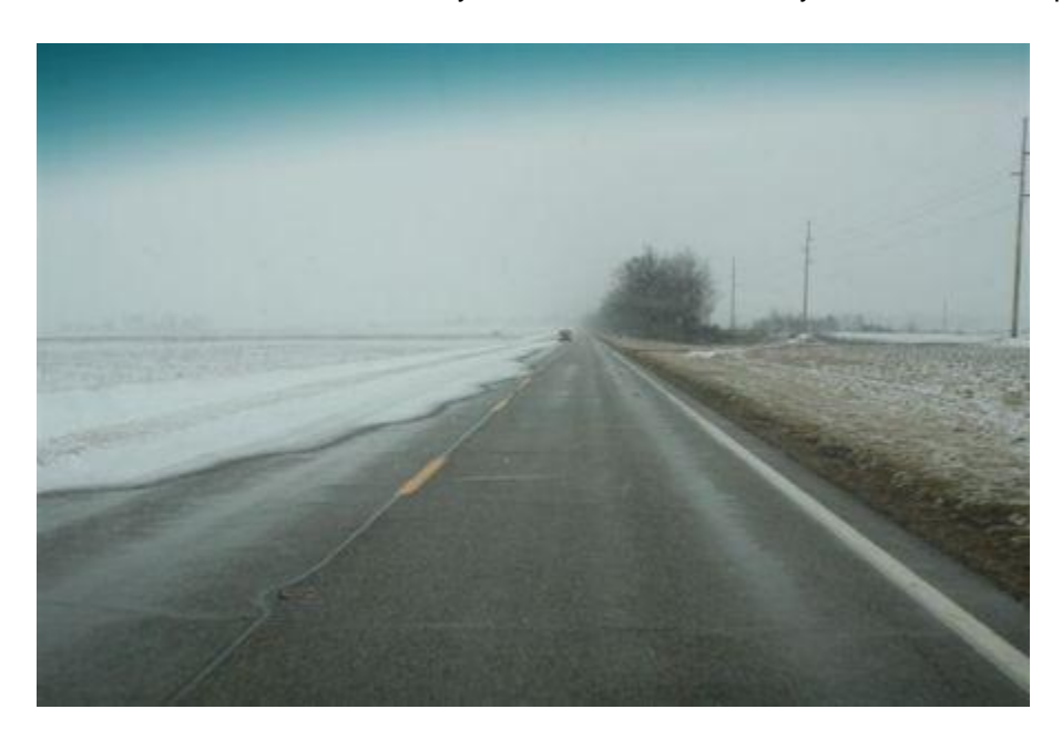
PUBLIC INFORMATION STATEMENT NATIONAL WEATHER SERVICE PADUCAH KY 205 PM CST SAT MAR 8 2008

Photo below taken between Grayville and Mt. Carmel, IL.