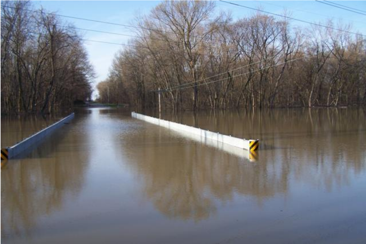
Hurricane Creek near the Big Muddy River on North Bend Road. About 5 miles NW of Carterville ,IL. - Ken Curry