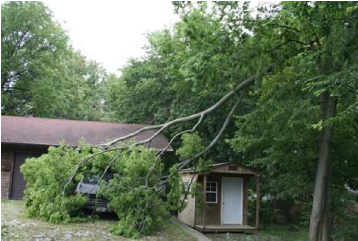
Tree on car – Norm Bredenkamp