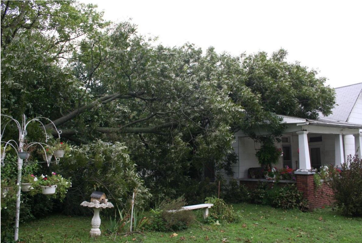
Tree on house – Norm Bredenkamp