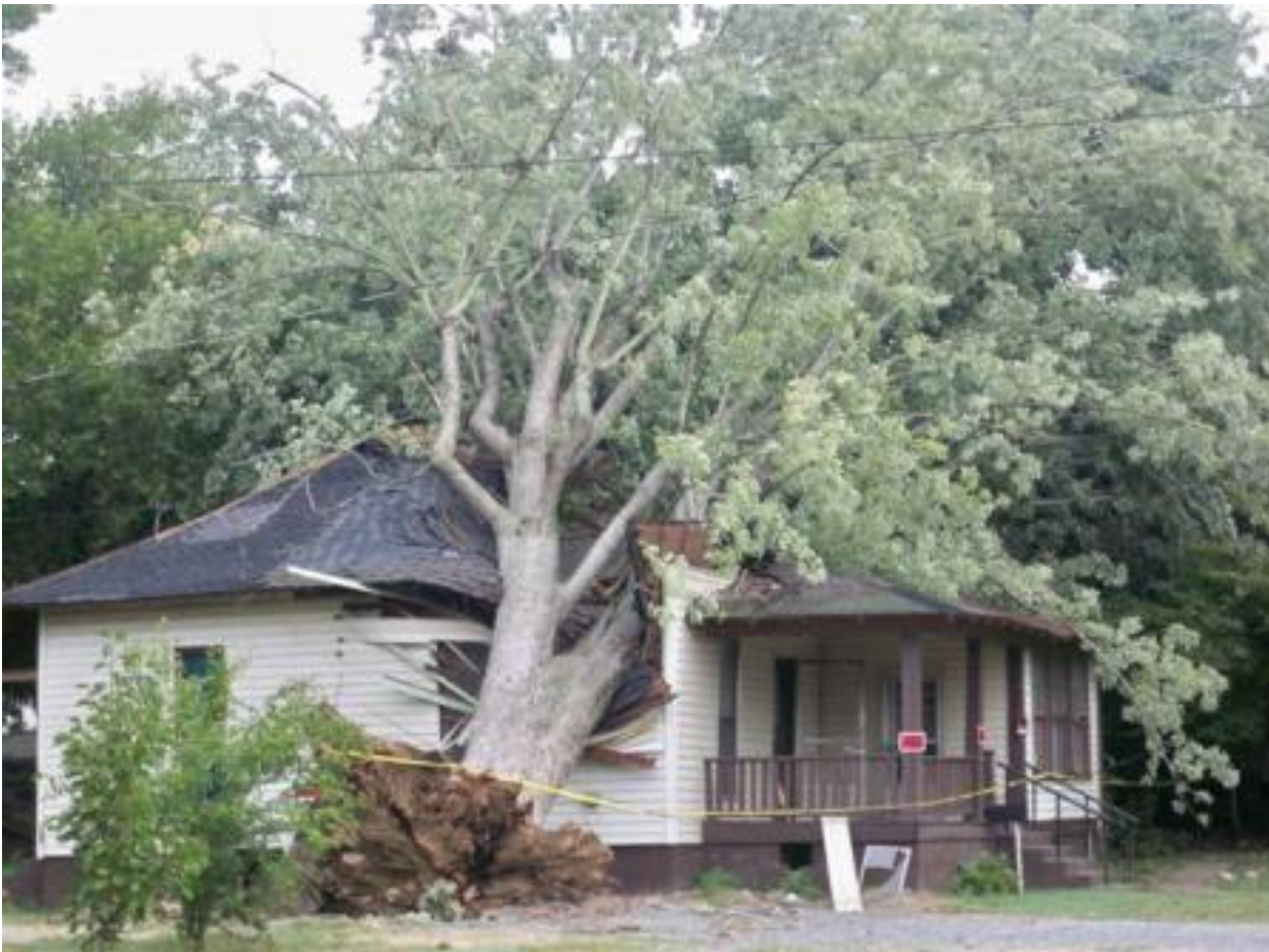
Tree on house in Mayfield