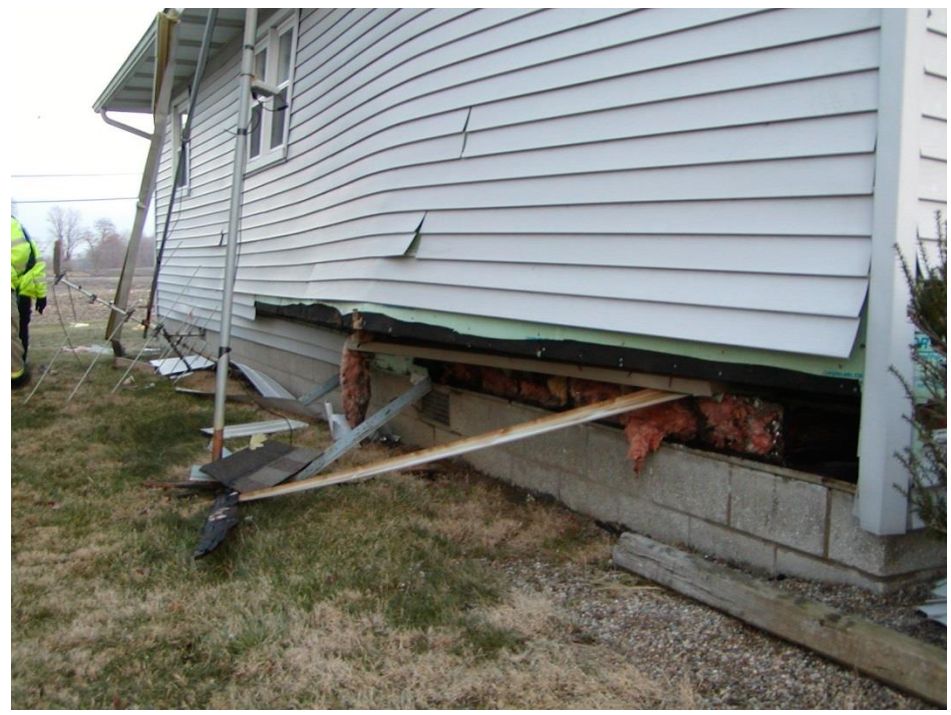
Tornado damage to a home in Oakland City.