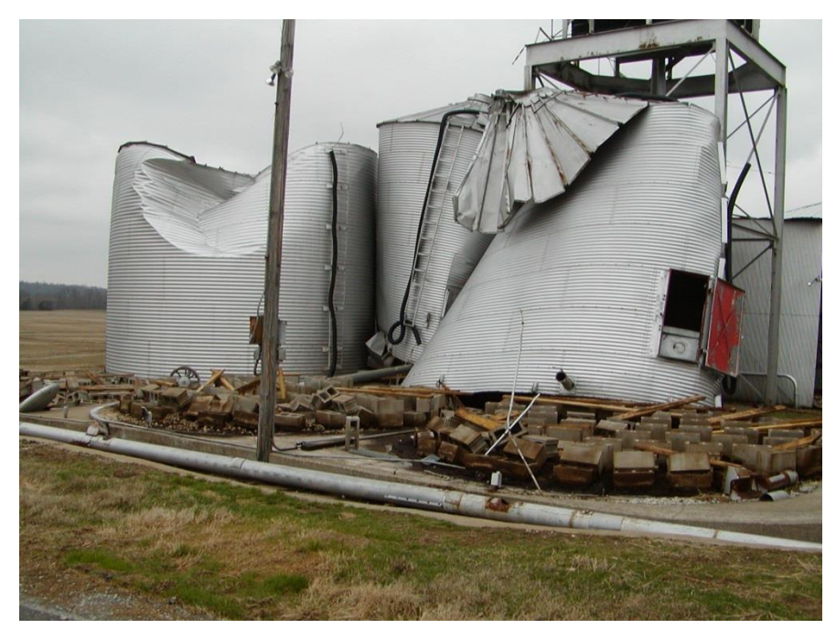
GRAIN BINS HEAVILY DAMAGED ON CAMPBELL LANE