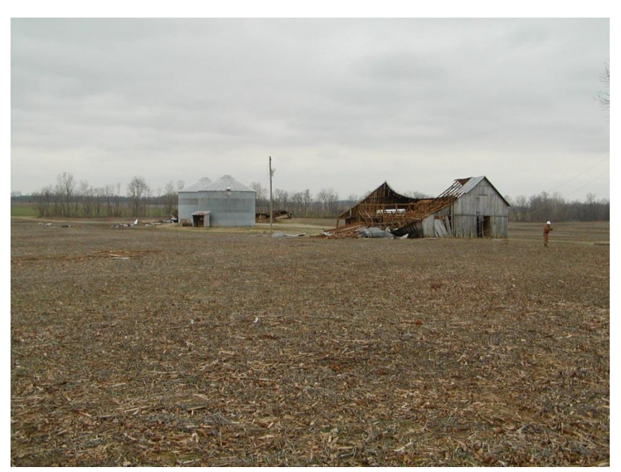
BARN DESTROYED ON PRINCETON ROAD.