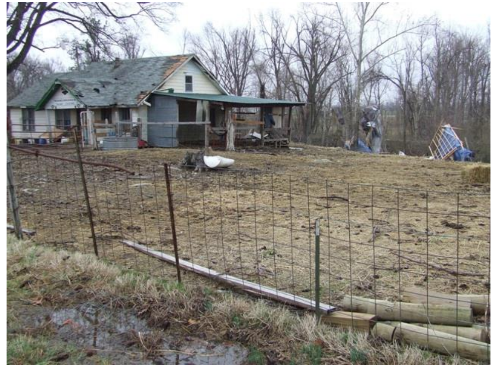
A HOME SUSTAINS ROOF DAMAGE AND A BARN IS DESTROYED ON HWY 45 SOUTHWEST OF FANCY FARM