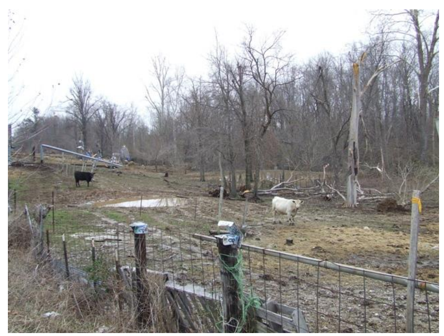
A BETTER VIEW OF TORNADO PATH SHOWING TREES UPROOTED...POLES BENT AND DESTROYED BARN.