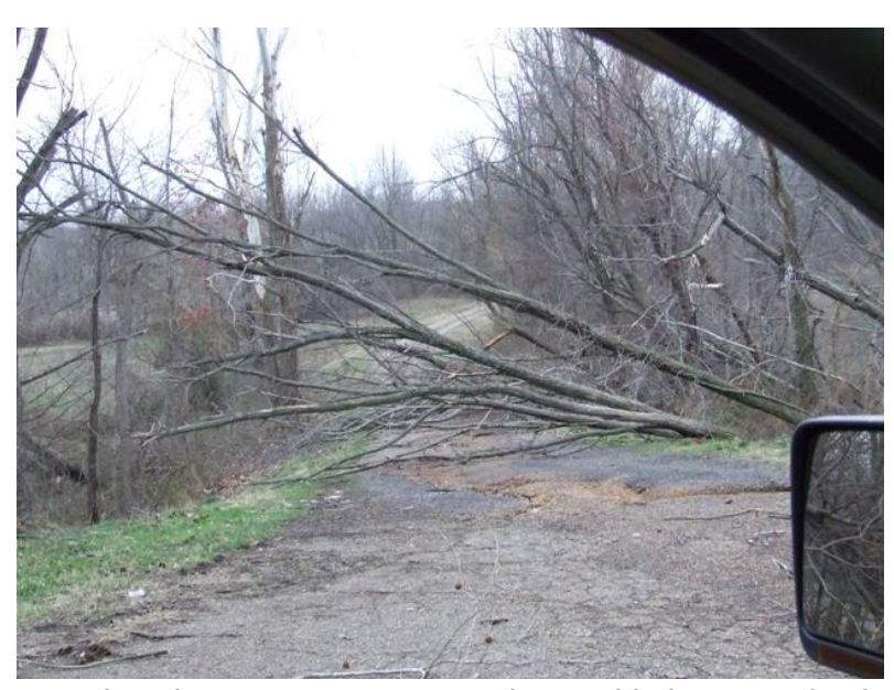
TREES UPROOTED/SNAPPED ON HOLLAND LANE AT THE OVERPASS OVER PURCHASE PARKWAY. PURCHASE PARKWAY SEEN IN THE BACKGROUND - LOOKING SOUTH (HICKMAN CO)