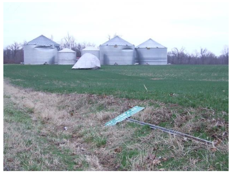
COUNTY SIGN BLOWN DOWN AND GRAIN BIN DAMAGE. GRAIN BIN IN FOREGROUND WAS LOFTED SEVERAL HUNDRED YARDS FROM A FARM TO THE SOUTHWEST.