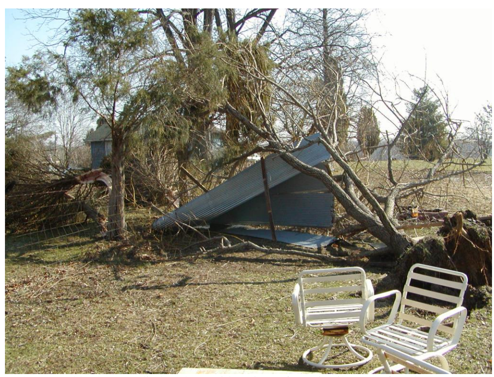
Uprooted trees and broken tree limbs, along with a piece of a grain silo, were found near Oakland City.