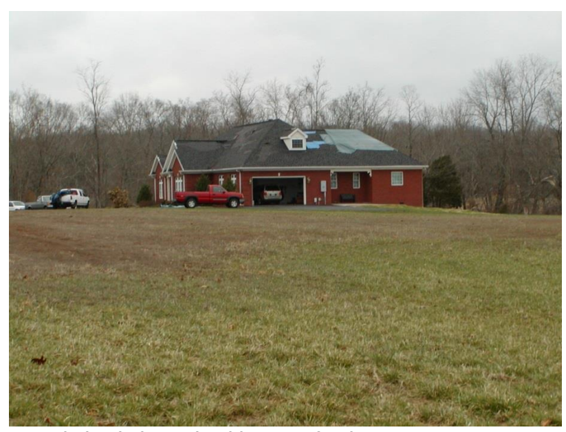
HOUSE SUSTAINS ROOF DAMAGE ON EVERETTE LANE