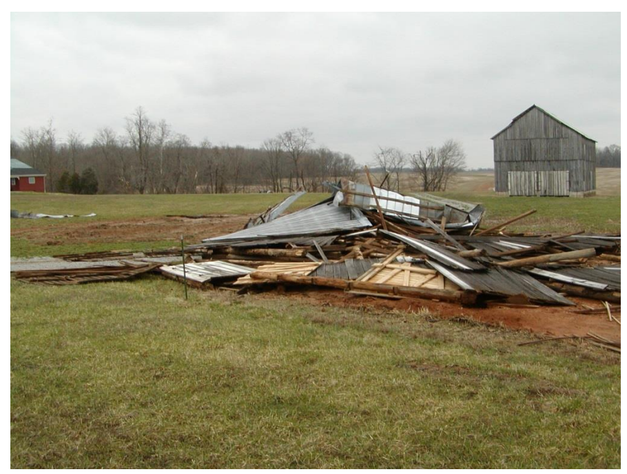
BARN DESTROYED ON EVERETTE LANE