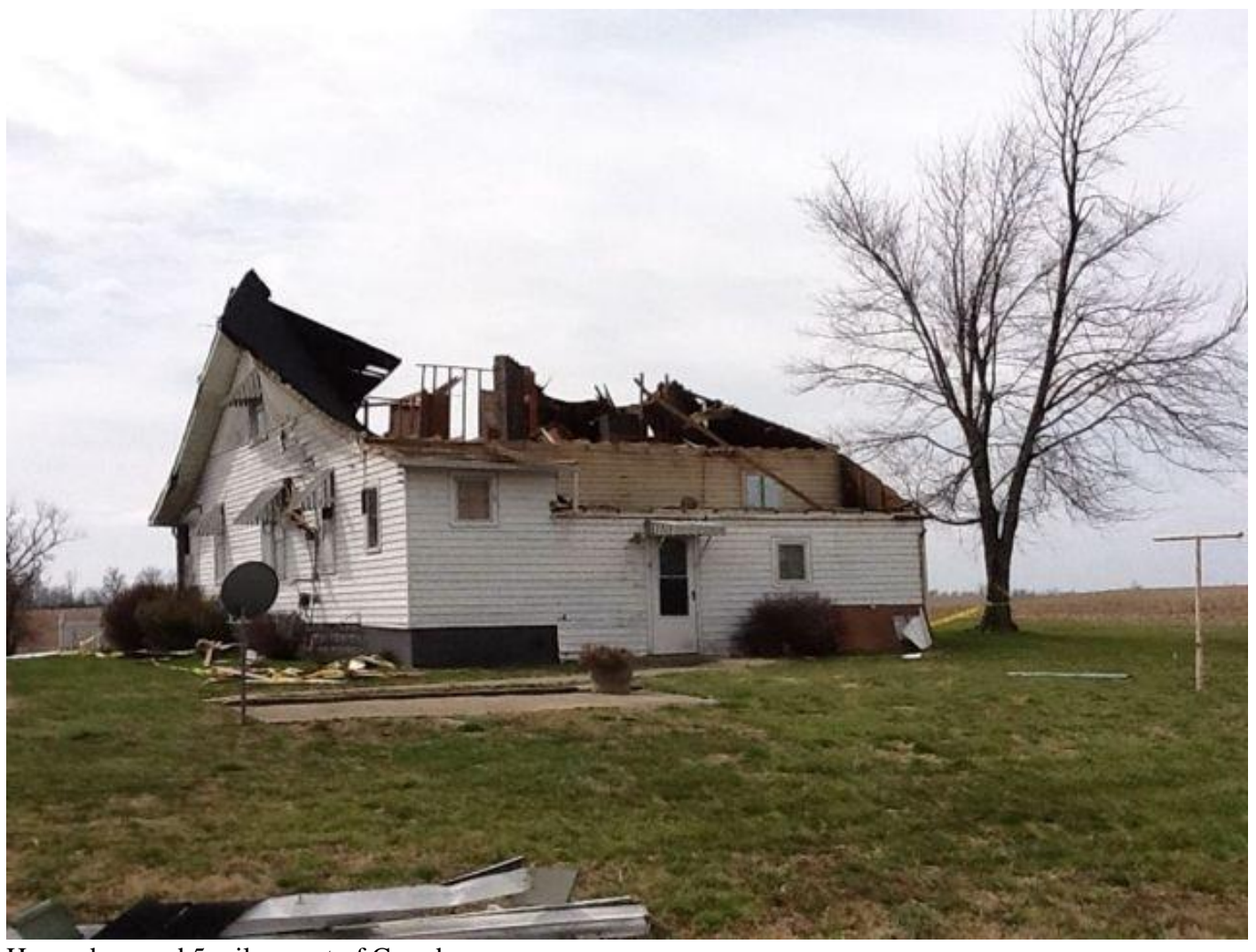
Home damaged 5 miles west of Corydon