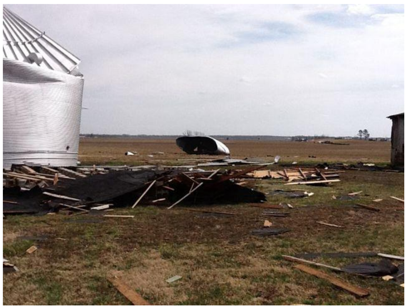
Damage west of Corydon - grain bins damaged/destroyed.