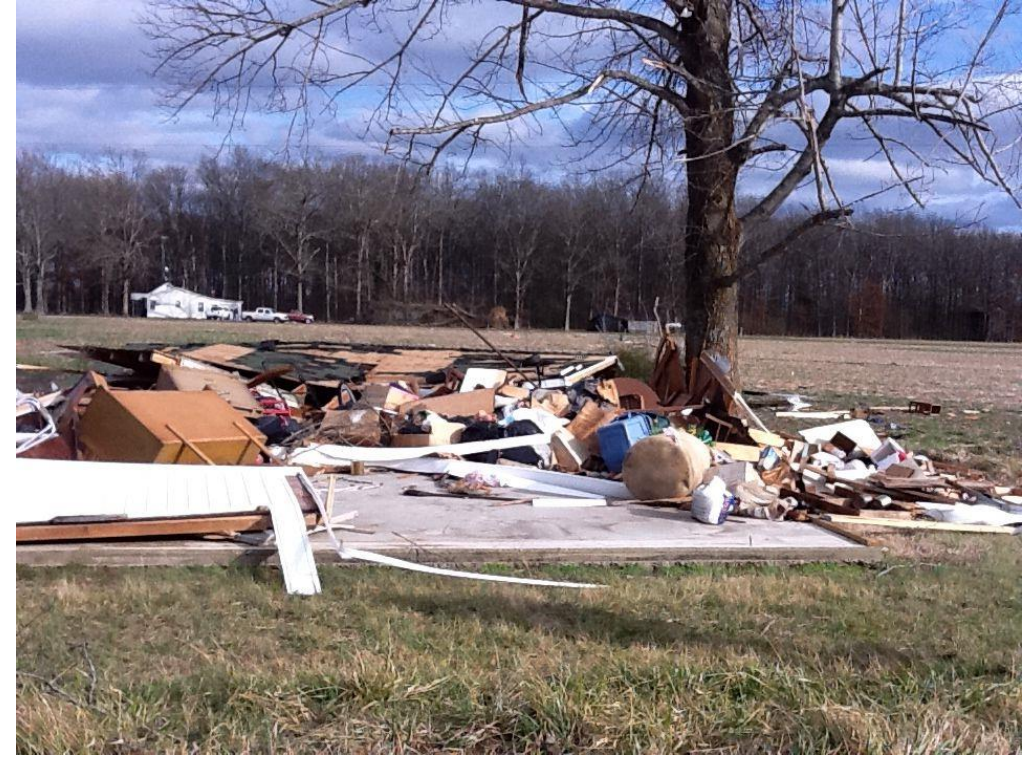
Demolished garage on New Providence Road