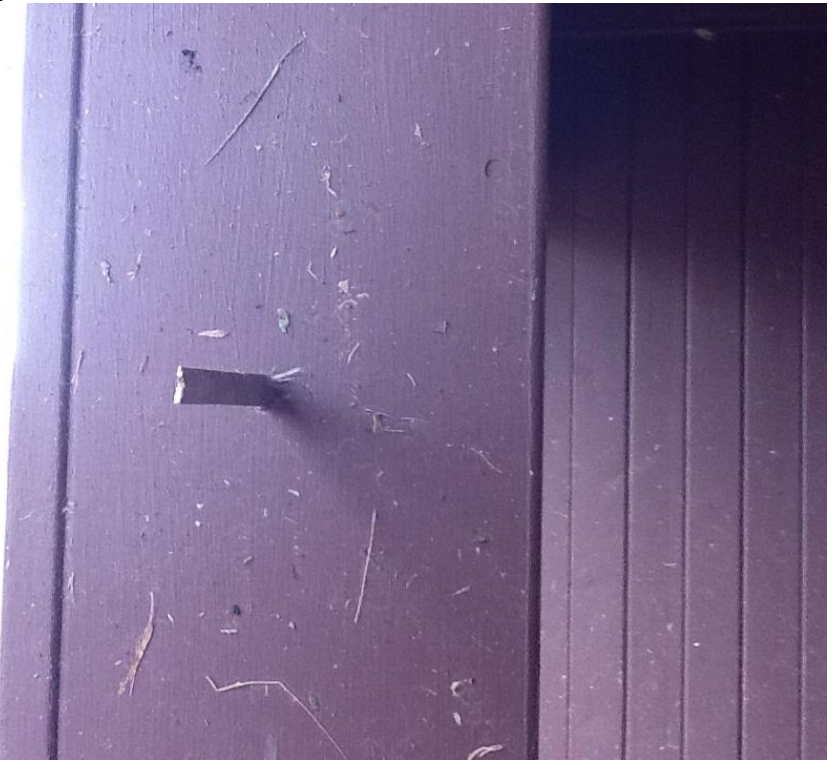
Projectile - Craig Road just east of Hazel