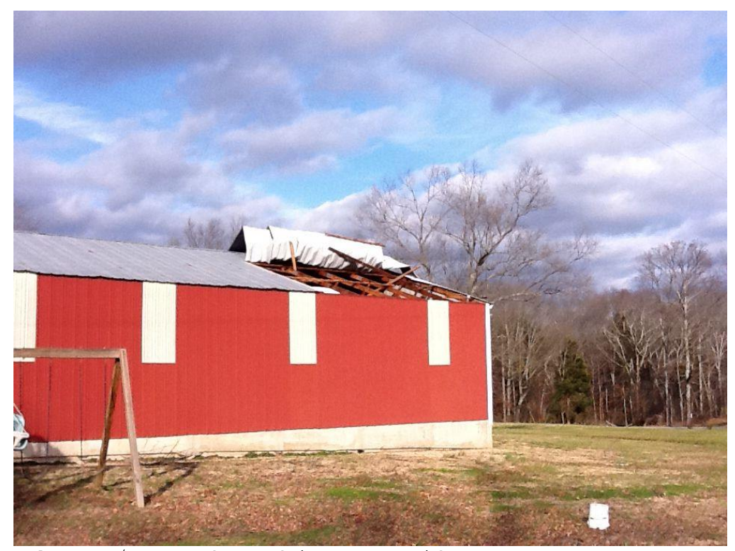
Pole Barn/Garage damaged in New Providence