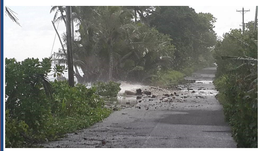
Picture-2 : High-Tides and Inundation pictures in Kosrae on December 4.