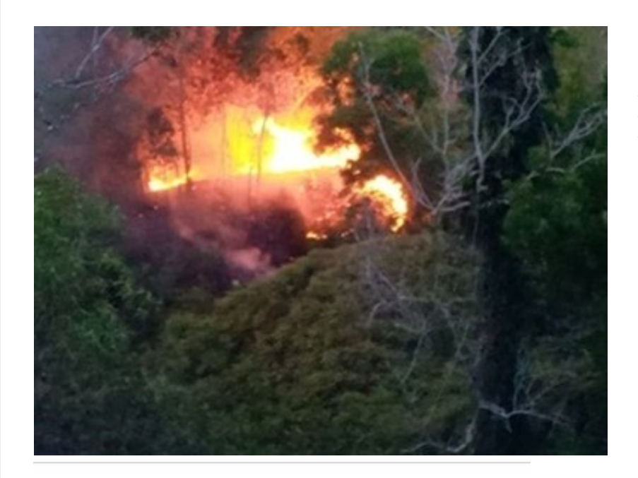
Figure 3 Slash and burn agricultural practices gone bad for Melekeok and Ngaraard States on April 29, 2020.