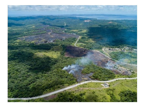
Figure 1 Estimated 5 mile charred ridge from Aimeliik to Ngatpang States March 29 thru April 1, 2020