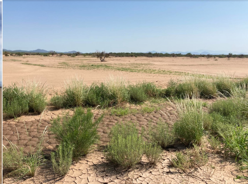
Figure 4: 98 Ranch abandoned farmland, May 2016, looking north