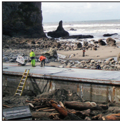
Japanese dock that washed on to the rugged north Washington coast.

The NWS spot forecasts were used to ensure safety for the daily