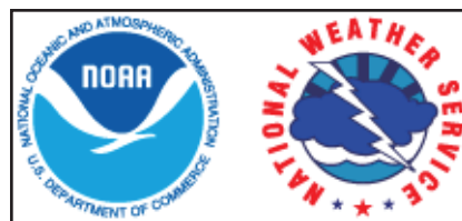
NOAA emblem and NWS logo