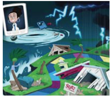
Students learn about weather safety playing an online game from PLAN!T