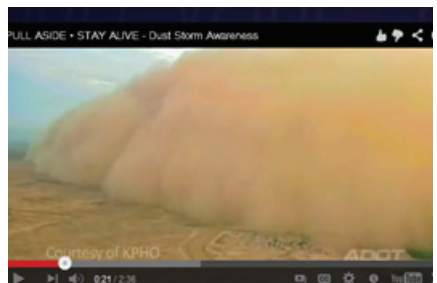
Dust Storm Safety Video available at pullasidestayalive.org

As a result of the meeting, NWS and the Arizona Department of Transportation (ADOT) are expanding